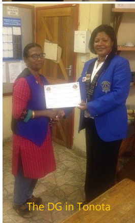
The DG in Tonota