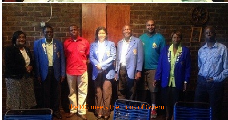
The DG meets the Lions of Gweru