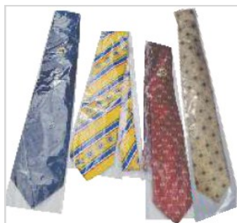
Executive Neck Ties - $10