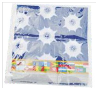
Lady Scarfs Blue - $15