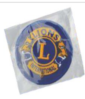
Iron on pocket badges - $6