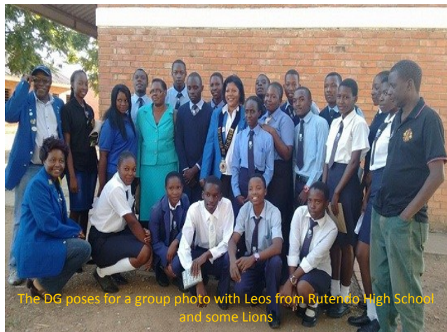
The DG poses for a group photo with Leos from Rutendo High School and some Lions

8 The Midlands OBSERVER Friday, 20 March, 2015