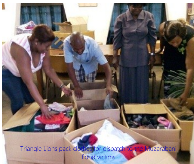
Triangle Lions pack clothes for dispatch to the Muzarabani flood victims