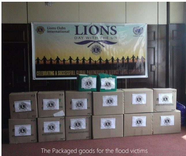
The Packaged goods for the flood victims

Floods that characterized the 2014-2015 rainy season left 500 families displaced in Mashonaland Central and the most affected areas include Mushumbi Pools, Mbi-re, Kanyemba, Chikafa, Muzarabani and Mukumbura, among other places.