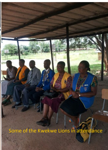
Some of the Kwekwe Lions in attendance