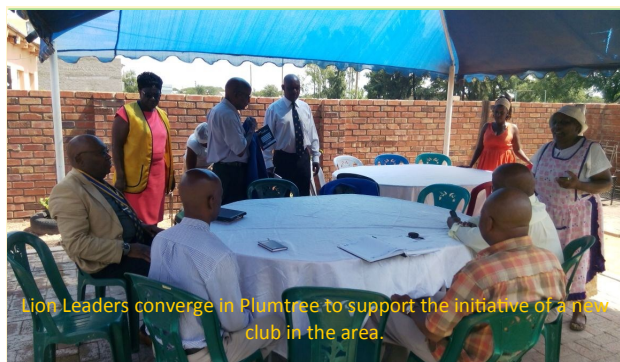
Lion Leaders converge in Plumtree to support the initiative of a new club in the area.