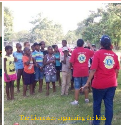
The Lionesses organizing the kids