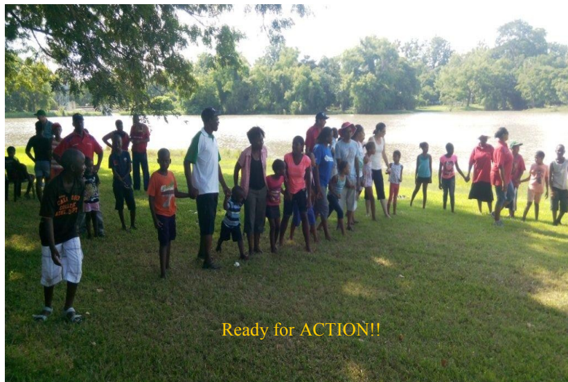
Ready for ACTION!!