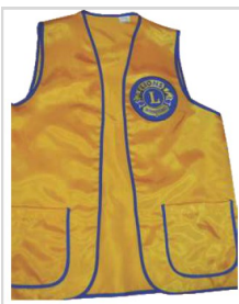
Yellow Waistcoats - $30