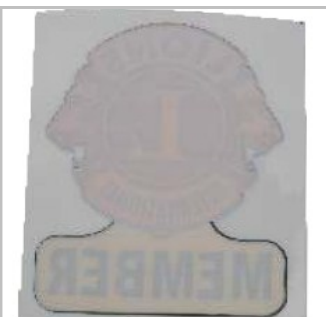
Car stickers - $4