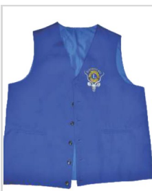
District 412 Blue Waistcoats - $30