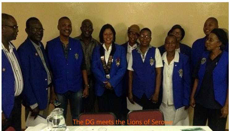
The DG meets the Lions of Serowe