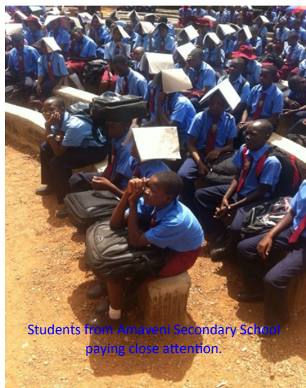
Students from Amaveni Secondary School paying close attention.

On the 30 th of January the Lions Club of Kwekwe partnered with the Kwekwe Police officers and visited Amaveni Secondary School to address the students on the dangers of drugs use and alcohol.