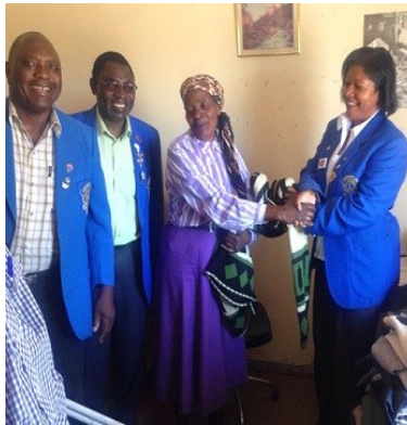
Lions of Gweru donate to Batanai Old Peoples' home