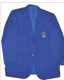
District 412 Blue Blazers - $80 for men; $65 for Ladies