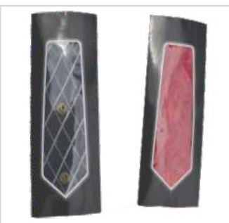
Special Neck Ties - $18