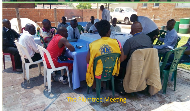
The Plumtree Meeting