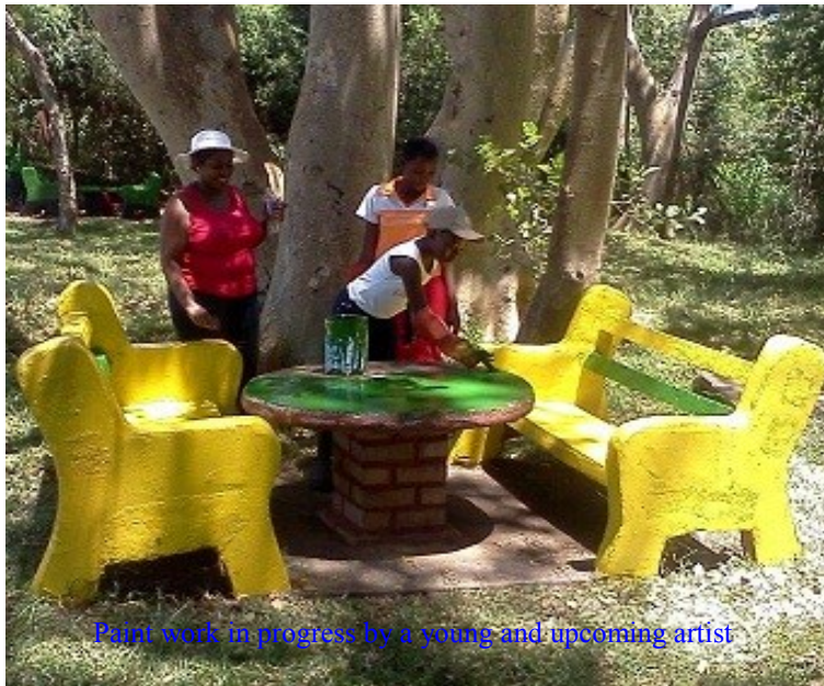
Paint work in progress by a young and upcoming artist