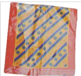
Lady Scarfs - $12