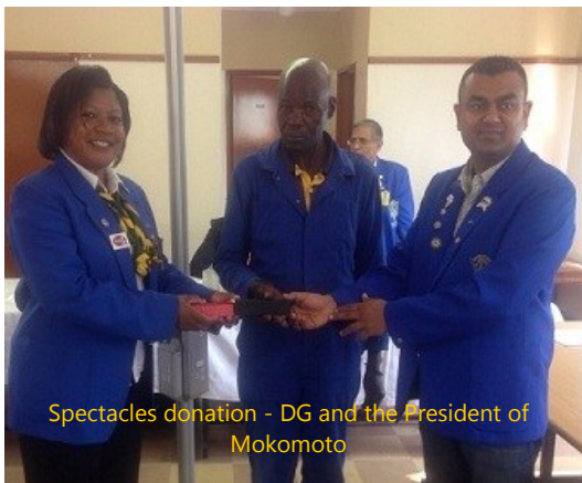
Spectacles donation - DG and the President of Mokomoto