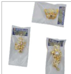
Lapel Pins - $5