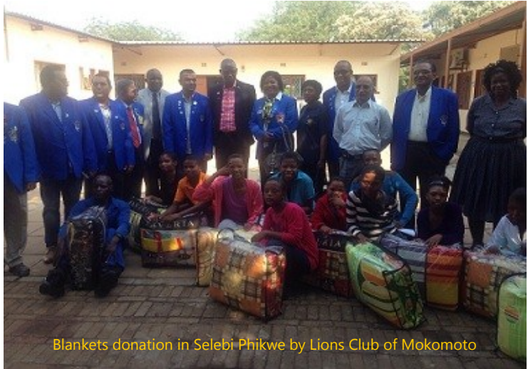
Blankets donation in Selebi Phikwe by Lions Club of Mokomoto