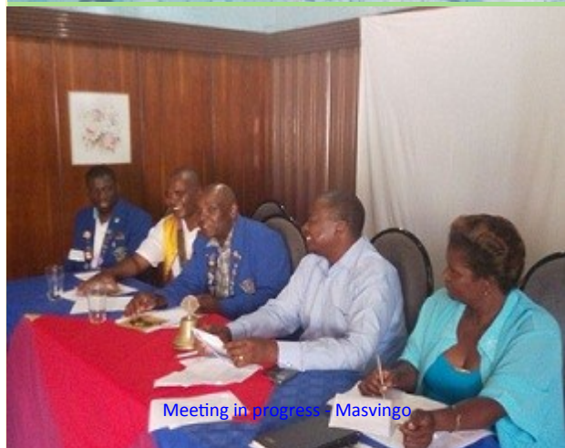
Meeting in progress - Masvingo