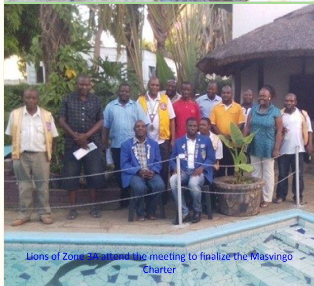
Lions of Zone 3A attend the meeting to finalize the Masvingo Charter