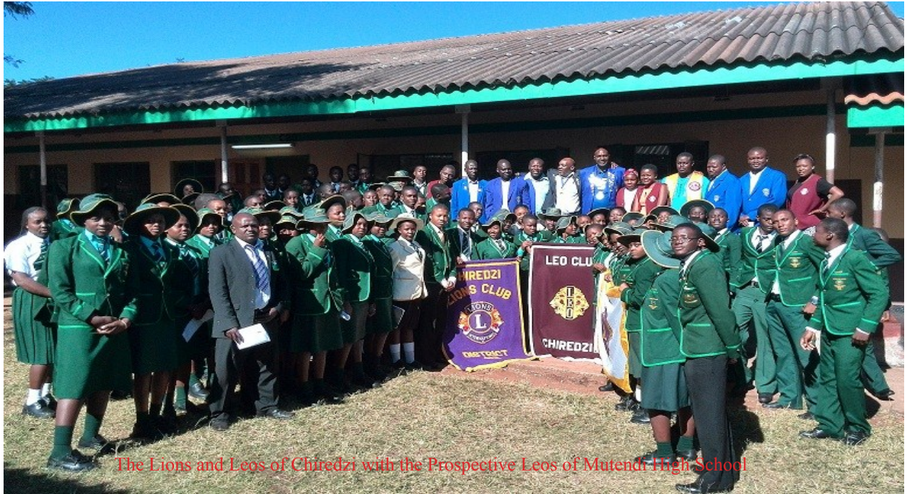
The Lions and Leos of Chiredzi with the Prospective Leos of Mutendi High School

On Africa Day, 25 May 2015 the Lions of Chiredzi and the Chiredzi Omega Leos Club travelled to Mutendi High School to do orientation of the Prospective Leos. Mutendi High School is situated some 150KM from Chiredzi.