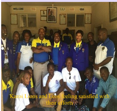
Karoi Lions and Leos feeling satisfied with their efforts

They contributed from their pockets to fund this project and contracted someone to do the tiling. The project took 1 week to complete.