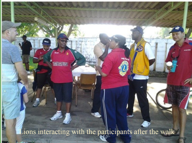
Lions interacting with the participants after the walk

On the 9 th of May, Lions Club of Triangle had a 5km walk around the Triangle Village for the Journey For Sight programme as an awareness to the community. The event started off at 0730hrs and had a massive turnout from the local community with a total number of 70 people attending.