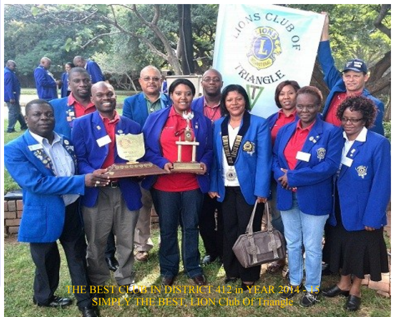
THE BEST CLUB IN DISTRICT 412 in YEAR 2014 - 15 SIMPLY THE BEST, LION Club Of Triangle