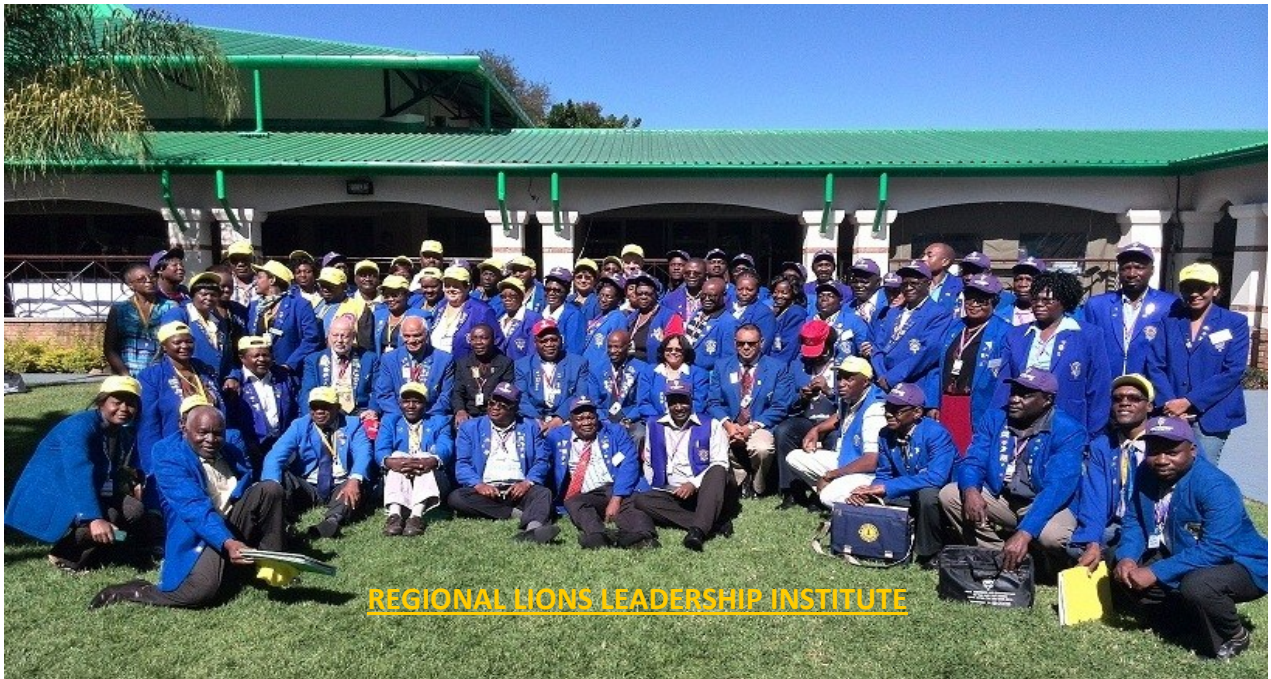
REGIONAL LIONS LEADERSHIP INSTITUTE