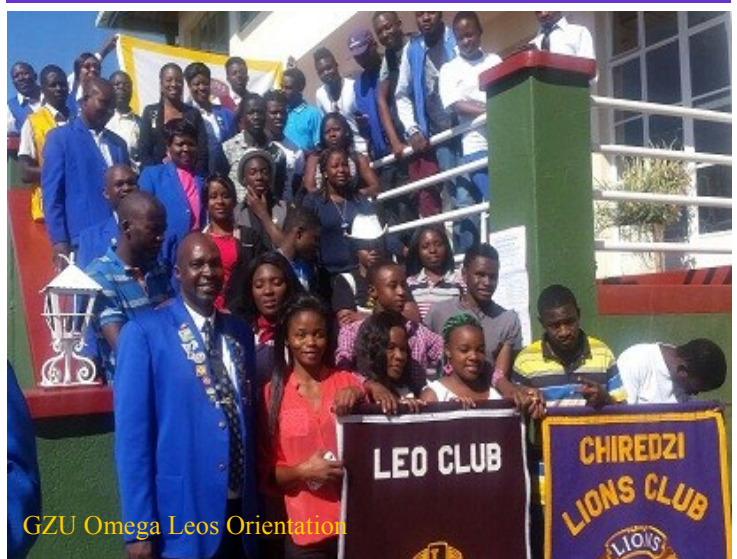
GZU Omega Leos Orientation

The orientation of GZU takes to 5 the number of Leo Clubs being sponsored by the Lions Club of Chiredzi.