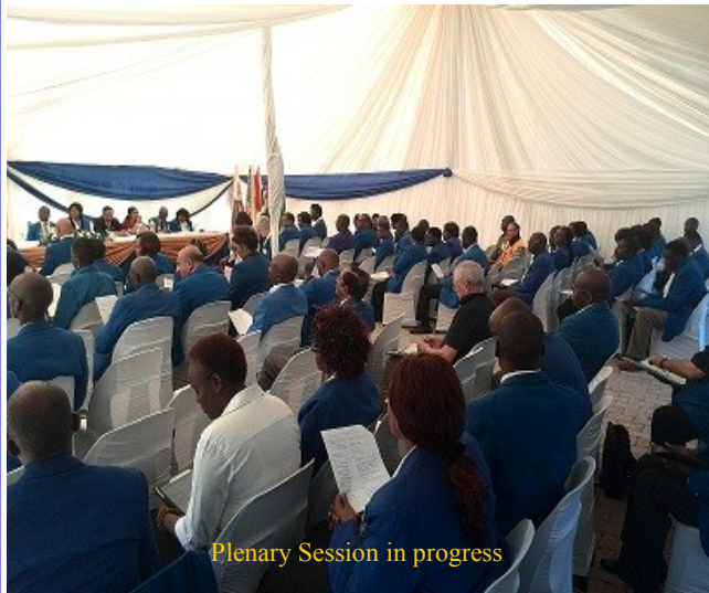
Plenary Session in progress