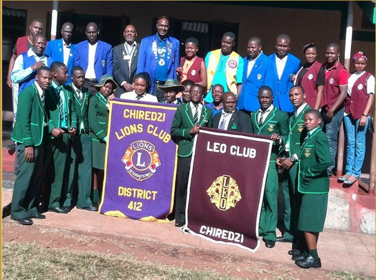
The Lions and Omega Leos of Chiredzi pose for a picture with the Prospective Board Members for Mutendi High School Alpha Leo Club after a successful orientation session.

LIONS DISTRICT 412 GOVERNOR'S NEWSLETTER