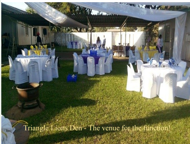
Triangle Lions Den - The venue for the function!

Lions Club of Triangle hosted this year's edition of "Into Africa Celebrations". The event is planned for the Africa Day "theme" where the main attraction is the African cuisine washed down with Afro beat music. 45 Adults and more than 20 kids paid to attend as well as 15 Lion members who were serving food, manning the gates and running the bar. A total of USD$295.00 was raised after paying off all expenses.