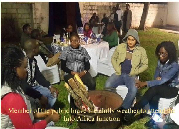
Member of the public brave the chilly weather to attend the Into Africa function