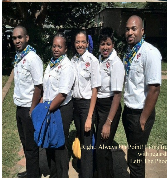
Right: Always On Point! Lions from Harare the Phoenix dictating the pace with regards to Club Regalia. Left: The Phoenix on Royalty night