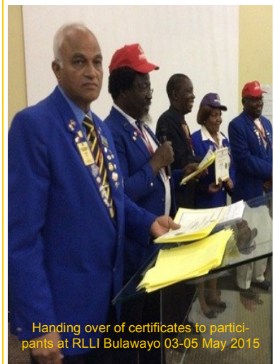
Handing over of certificates to participants at RLLI Bulawayo 03-05 May 2015