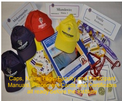
Caps, Name Tags, Faculty and Participant Manuals, Placement Cards and Certificates all ready before the Institute.