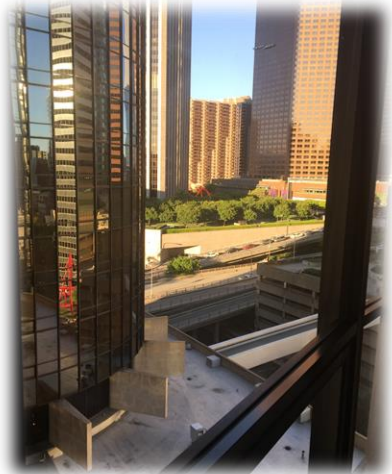
View from my room