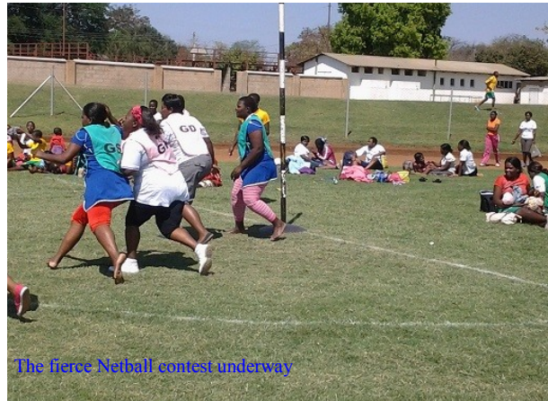
The fierce Netball contest underway

On sale was sadza and beef stew prepared by the Lions, and the Lions were also running the bar. The Club managed to raise USD$697 from this fun-filled family event.