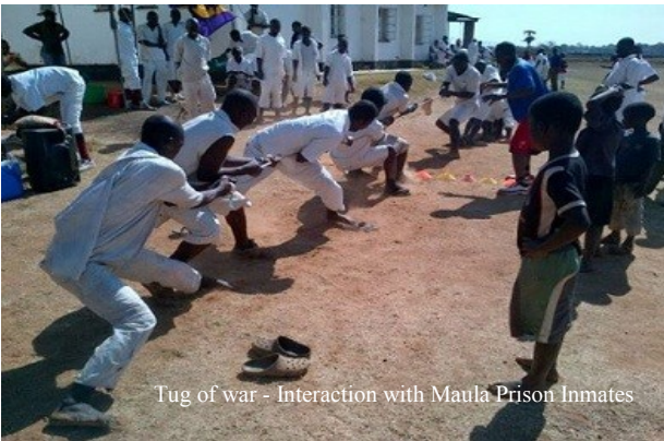
Tug of war - Interaction with Maula Prison Inmates