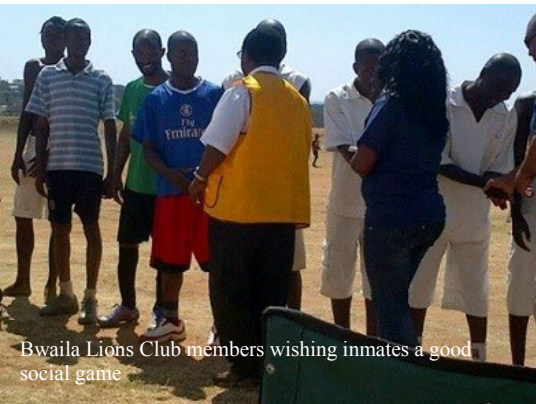
Bwaila Lions Club members wishing inmates a good social game

On the 26th of July, Bwaila Lions Club distributed Drugs to Maula Prison worth 13,000 USD and a Team of Volunteer Doctors and Nurses helped treating the inmates. It was an open day, Social games, snacks and Music were arranged.