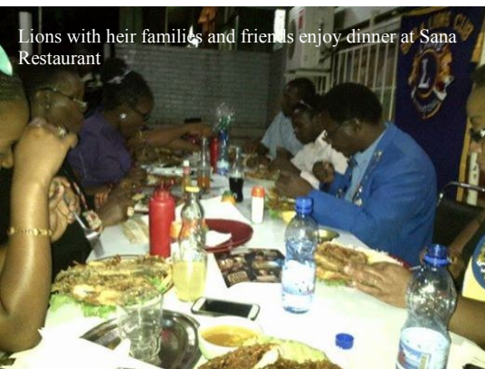
Lions with their families and friends enjoy dinner at Sana Restaurant

Bwaila Lions Club organized a dinner meeting at Sana Restaurant. 16 September was a family day, Members brought family and friends, introducing them to Lionism. After dinner Lions took time to interact with Street kids.