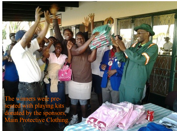
The winners were presented with playing kits donated by the sponsors, Main Protective Clothing.