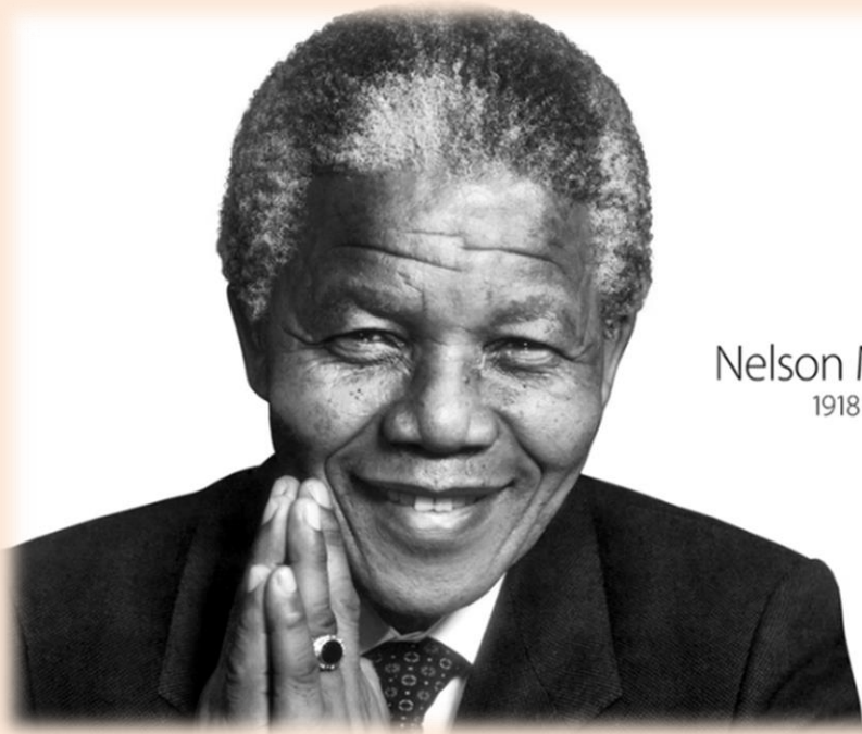
Nelson Mandela 1918-2013

Christmas Dinner & Induction Carols by Candlelight Getting to Know your Lions