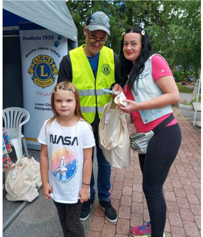
LC Pihtipudas and LC Pihtipudas / Emmit welcomed the Ukrainian refugees who arrived in the village to the market event. During the spring, the Lions prepared furnished apartments for refugees, and donating bags was an important part of helping.