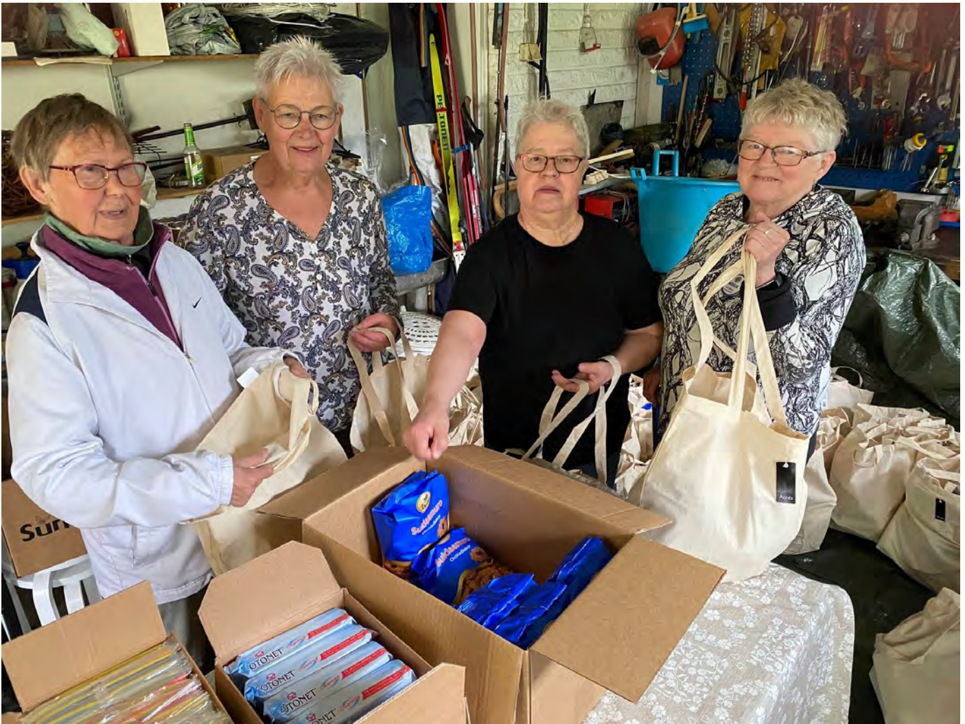
LC Vaajakoski / Ewe lions in aid work. The supplies to be donated were collected in bags from Jyskän Varastomyymälä in Jyväskylä. LC Vaajakoski / Ewe did the most work here. Other clubs just had to pick up the pre-assembled bags and distribute them in their own locality.