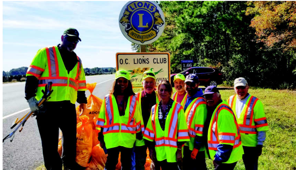
The Ocean City Lions Club members join the environmental efforts of our community by caring for a stretch of Route 611 near the Ocean City airport.