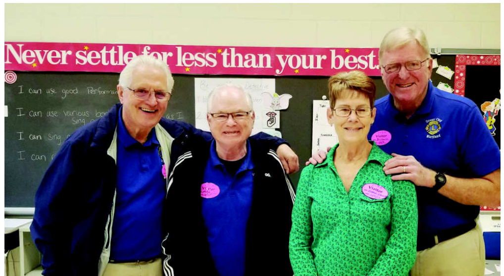
The Ocean City Lions Club provided vision screenings for Ocean City Elementary School Preschool and Kindergarten Students. Pictured