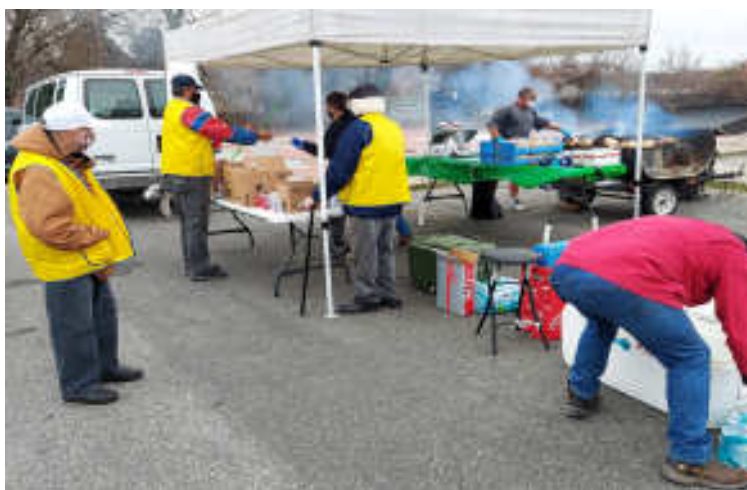
Roast Beef sandwich fundraiser.