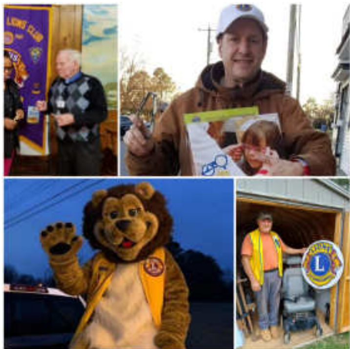
Ongoing eyeglass collection and loaning medical equipment out to the community.