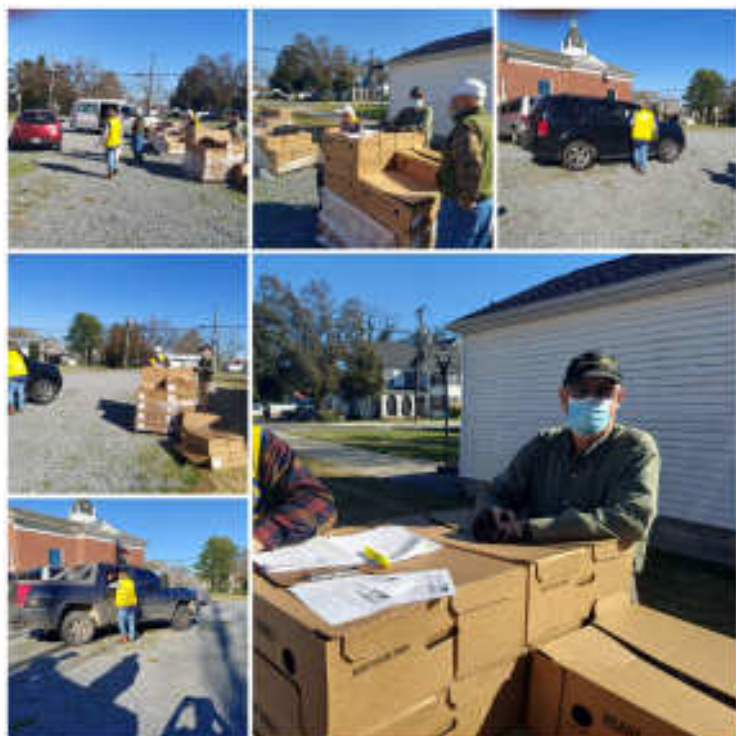
Lions and MD Food Bank team up and feed 100 families for Thanksgiving