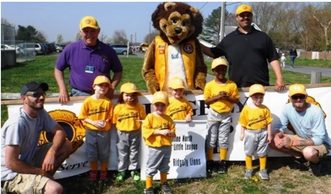
The North Carolina T-Ball Team sponsored by the Ridgely Lions Club.