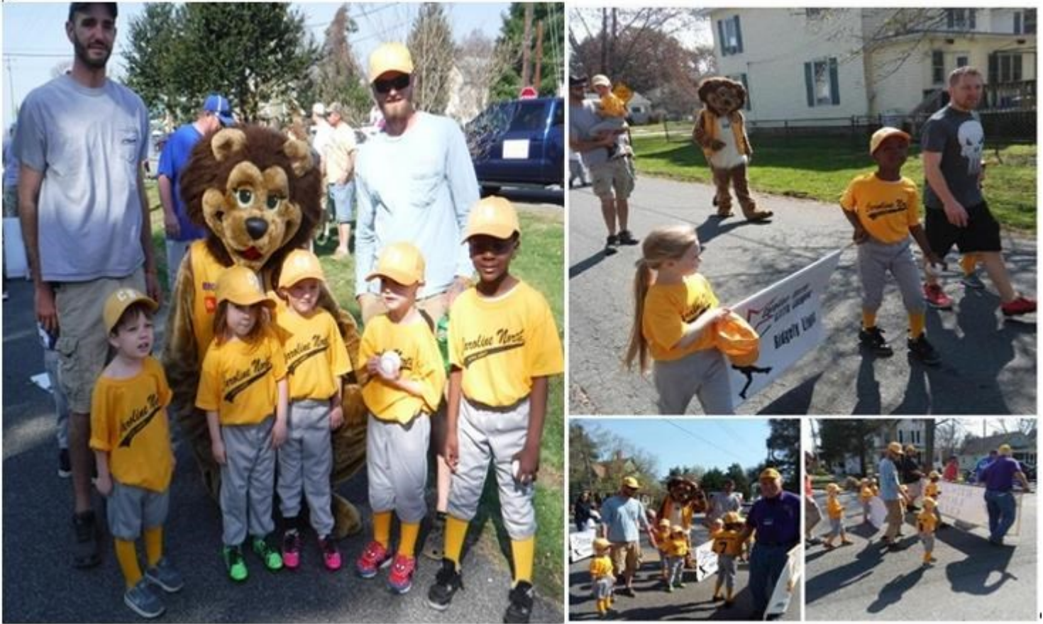
On Saturday April 14 th the North Carolina Little League held their Opening Day with a parade of all the teams in the league. The Ridgely Lions along with their mascot “Rion” the Lion were very proud to march in the parade with the 1 st year Little Leaguers