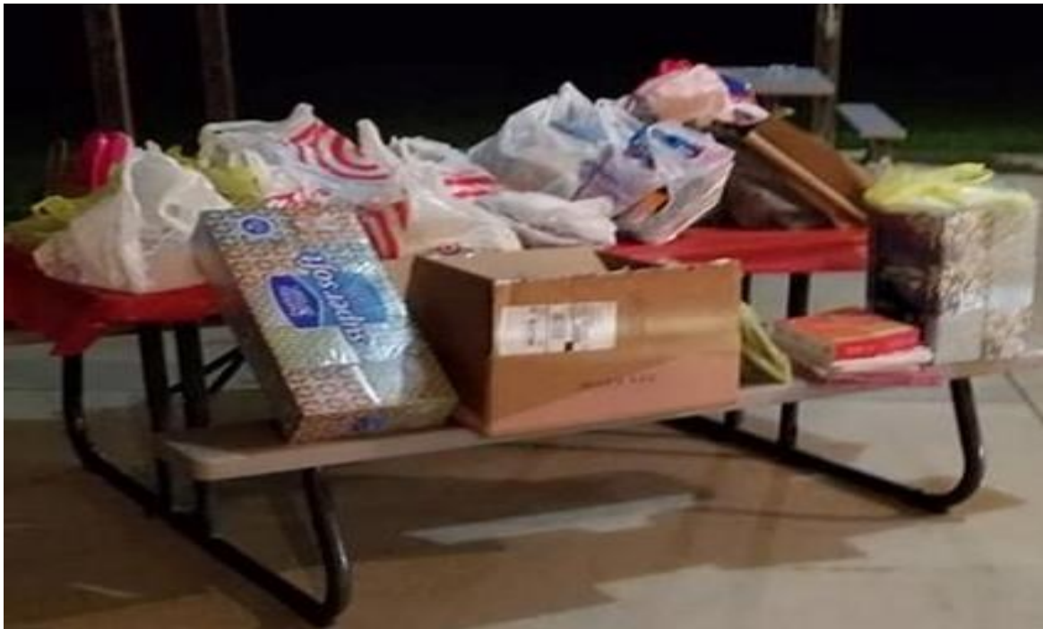
Federalsburg Lions Club collected school supplies for Federalsburg Elementary

Please send me notes about how your club is serving your area and don't forget to post it on twitter at #WESERVE.