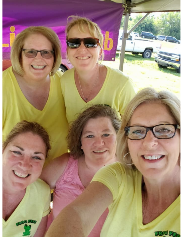
2nd Annual Frog Fest on June 30th, 2018.