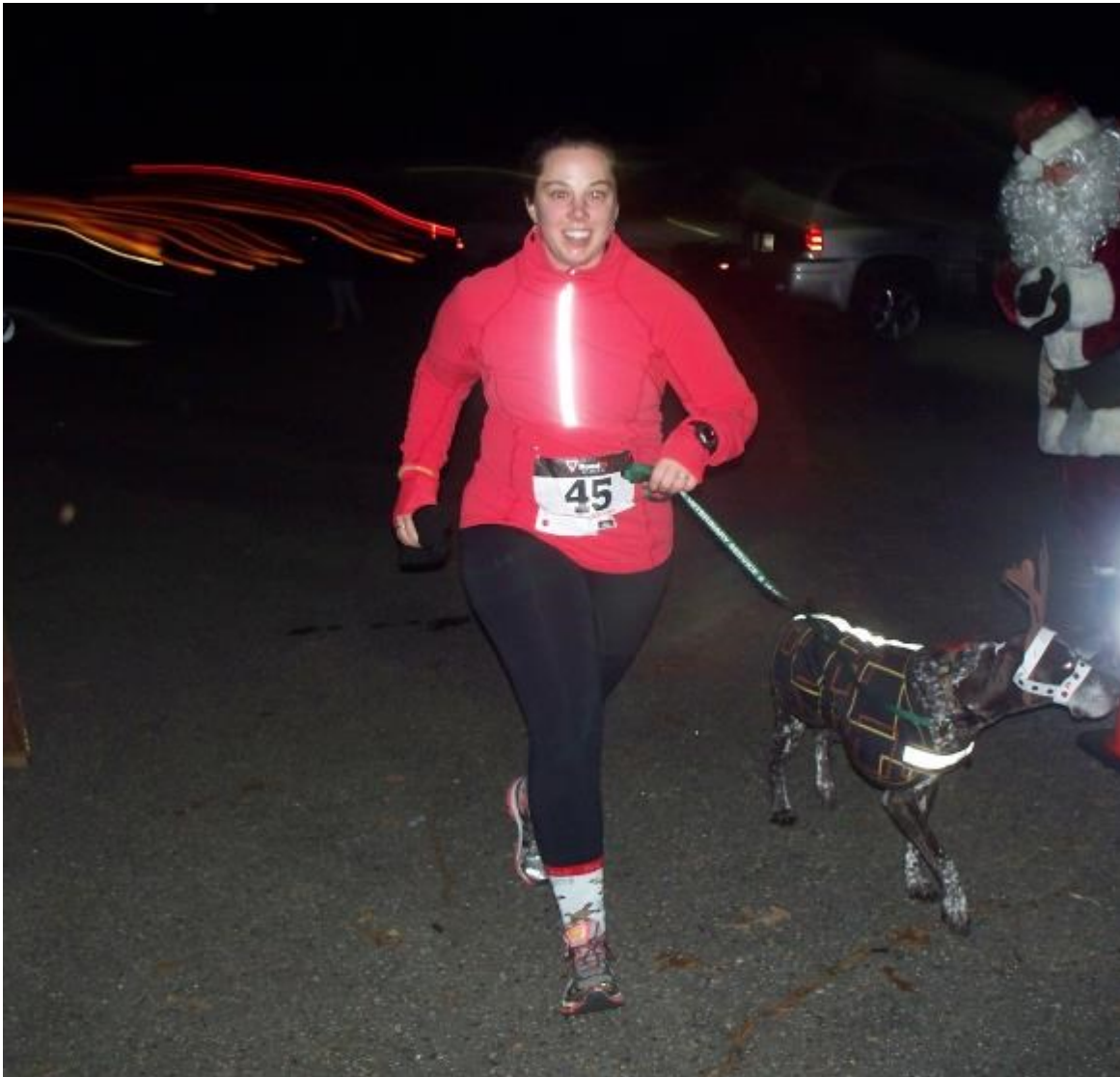
A pet friendly "Reindeer" canine team competes in the Santa Chase

Come Run in the Dark So Others Might See