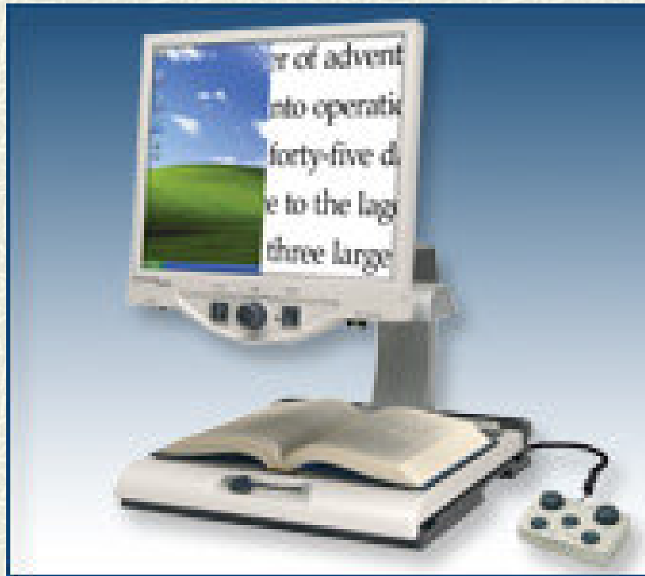
Desktop Electronic Magnifier