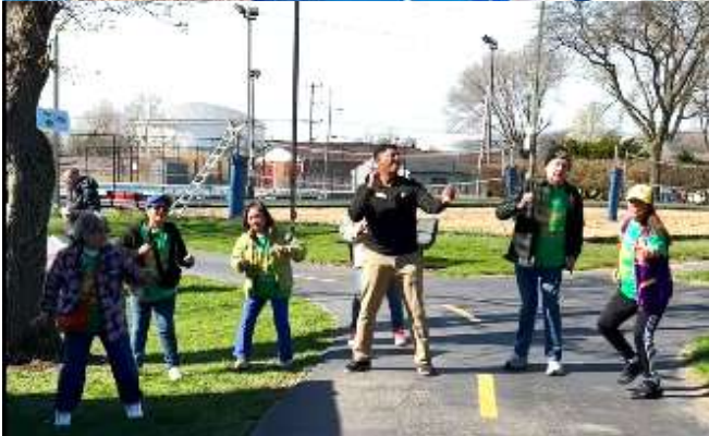
Only at our park does a Walk turn into a Dance Party!