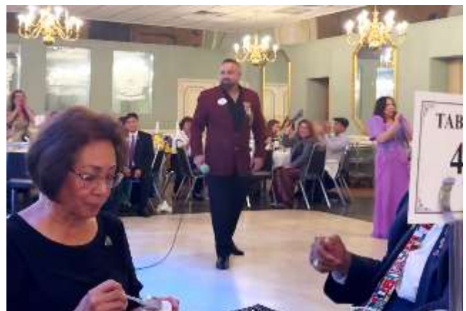
Governor's visit to club.