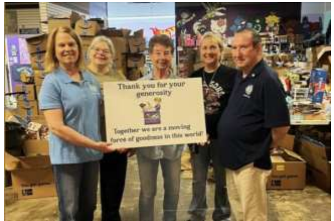
connection in Orland Park.

The Orland Park Lions presented a check to Christmas Without Cancer from proceeds from the Queen of Hearts.