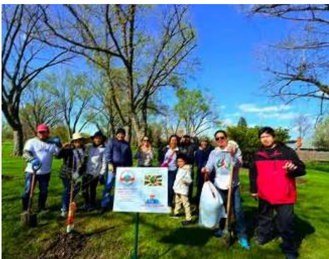
Despite the biting wind and cold, the members of Chicago