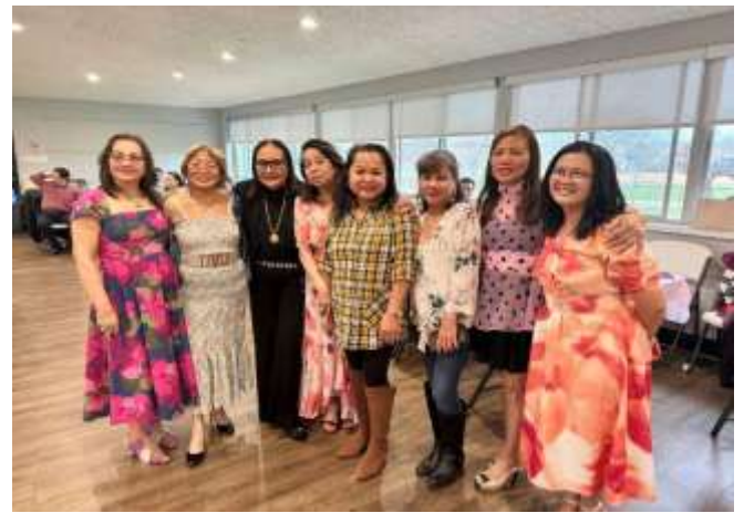
Chicago Global Lions Club's Fund raiser with dance and dinner.