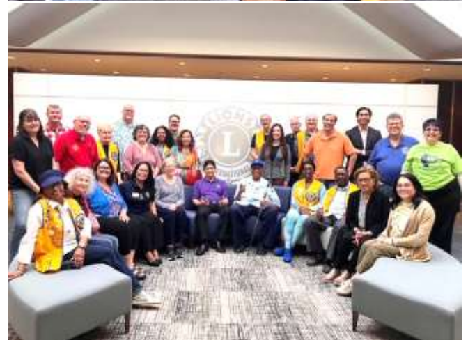
Englewood Lions participated in a recycling project by collecting and giving to the Lions of Illinois Foundation (2) thirty-gallon kitchen garbage bags of aluminum tops and pop can tabs at the Region 4 Meeting at Lions Clubs International Headquarters, April 24, 2026.