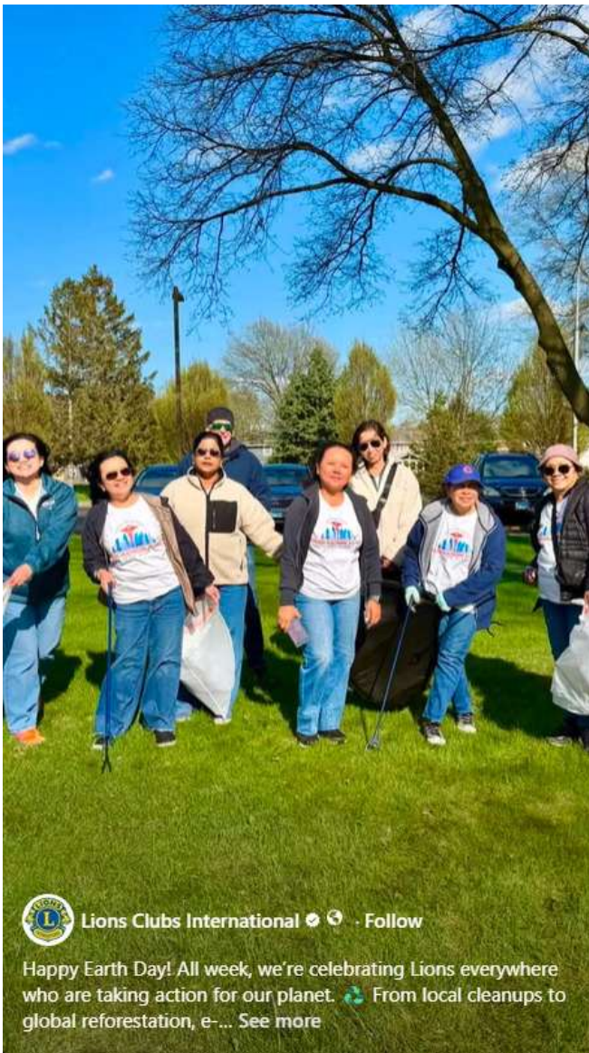
Chicago Healthcare Alliance Lions in an LCI Video Clip.