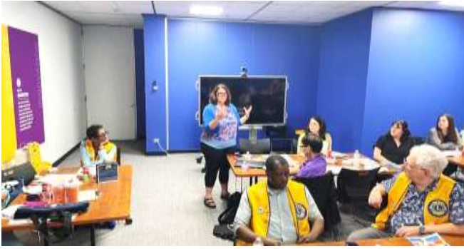
District 1A Region 4 Meeting.

Chicago Healthcare Alliance Lions Club joined Strides for Diabetes Walk Awareness Walk of the Stickney-Forest View Lions Club .