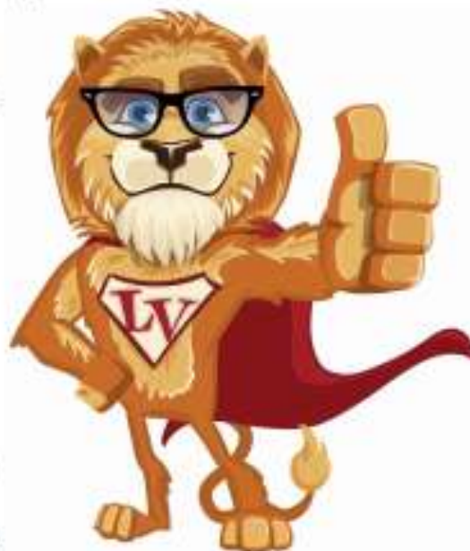
Seeing is Believing Mascot, EL-Vee

The LIF "Seeing is Believing" Low Vision Program for Students provides a visually impaired child with the optical tools and training necessary to help prevent further vision loss or even blindness. But more importantly, these are the children we have promised to help by preserving what sight they have left. Their future is in our hands.