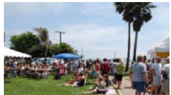
Just another day in paradise.