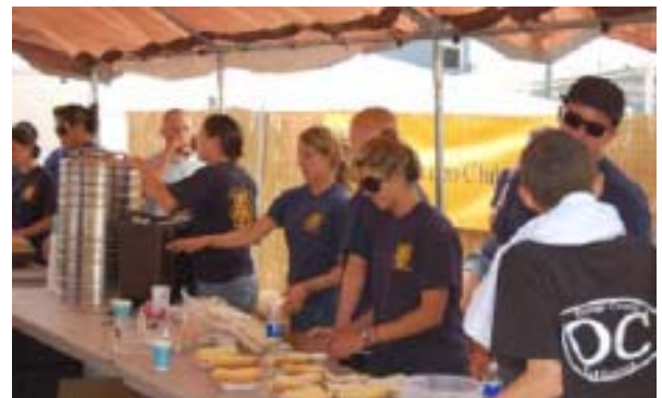
The Seal Beach Leos Club is always there to help.

In addition to the Fish Fry, The SB Lions held their annual truck raffle drawing. They have no problem selling all 500 of the $100 tickets available. Word has spread fast and far. This year's winner of a 2007 Nissan Xterra was from Plano, Texas!