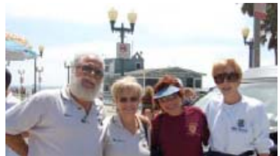
Guests come from far and wide, or at least from Huntington Beach to experience the fun and food, as did these Huntington Beach Host Lions.

In addition to the Fish Fry, The SB Lions held their annual truck raffle drawing. They have no problem selling all 500 of the $100 tickets available. Word has spread fast and far. This year's winner of a 2007 Nissan Xterra was from Plano, Texas!