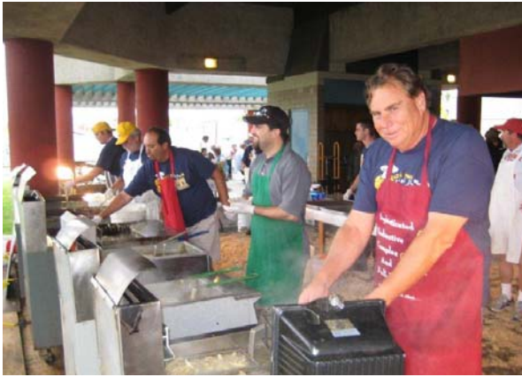
COSTA MESA LIONS FRY THE FISH