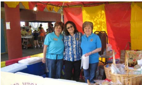
BUSY HARBOR MESA LIONS