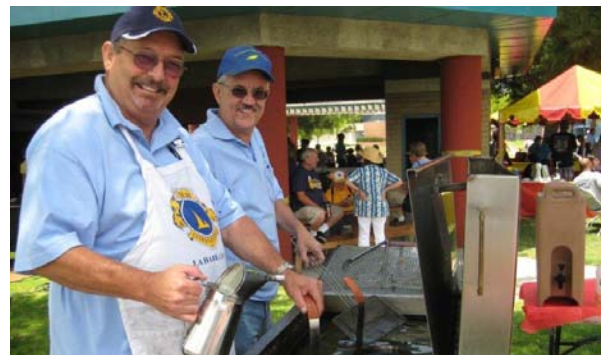
LA HABRA HOST LIONS FRYING FUNNELL CAKES