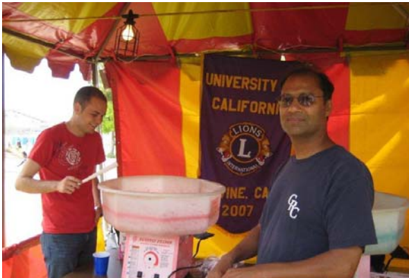
UCI LIONS SPUN THE COTTON CANDY