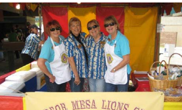
HARBOR MESA LIONS OPEN FOR BUSINESS