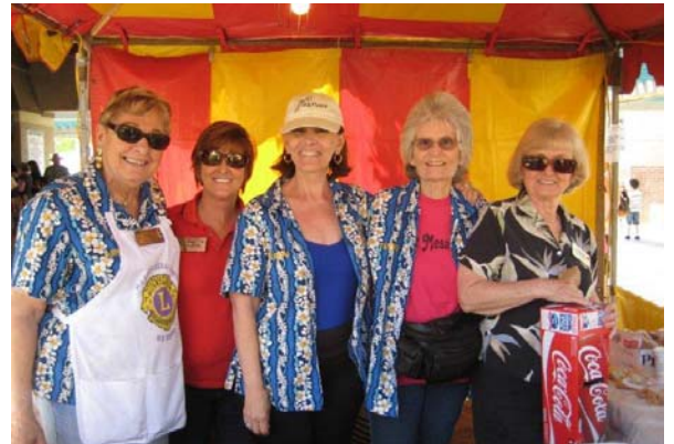
HARBOR MESA LIONS BREAK OUT THE BEVERAGES