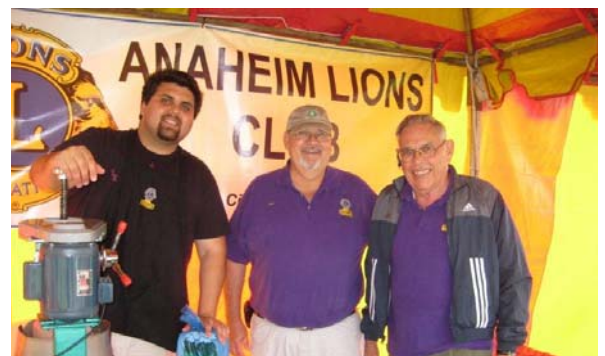
ANAHEIM LIONS SELLING ICEES