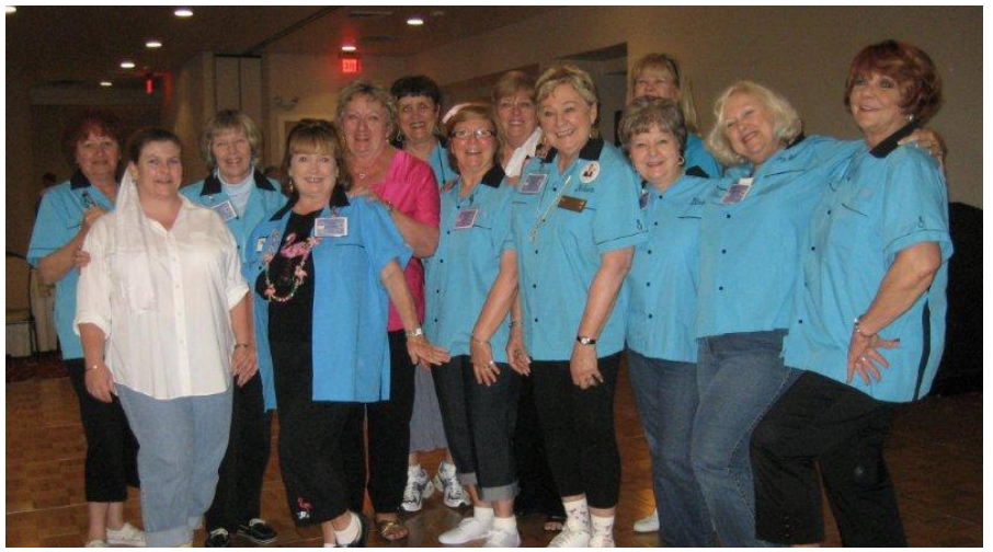
THE HARBOR MESA BOWLING TEAM