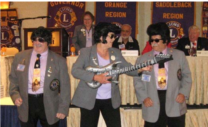
ELVIS WAS IN THE HOUSE