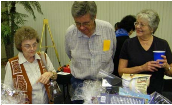
CHECKING OUT THE SILENT AUCTION