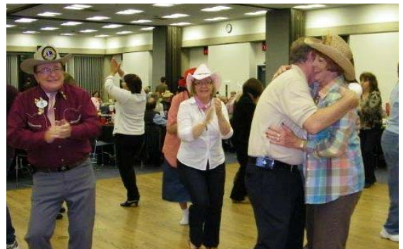
Dancing the night away!