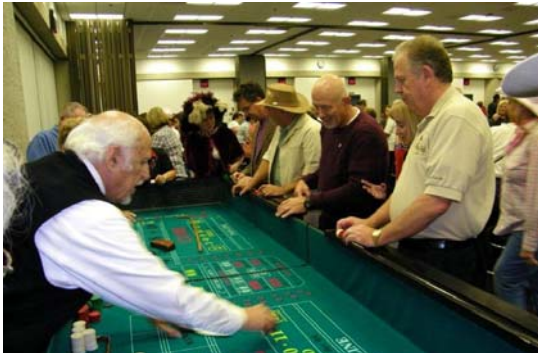
Hb LIONS ENJOY THE CRAPS TABLE