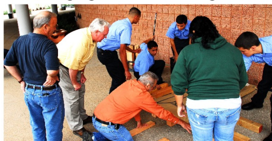
Far Left and Left District 4-L4 Lions learn to leverage and box crib. If a person is trapped beneath a heavy fallen object, rescuers can use blocks of wood and pry bars to lift the heavy item off the victim.