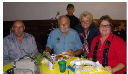
CUCAMONGA DISTRICT HOST LIONS