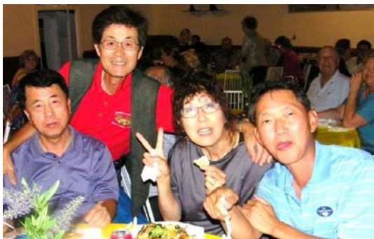
O.C. CHINESE AMERICAN LIONS