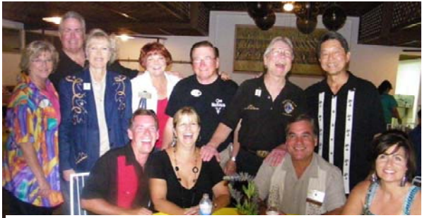
CABINET MEMBERS WITH ONTARIO HOST LIONS