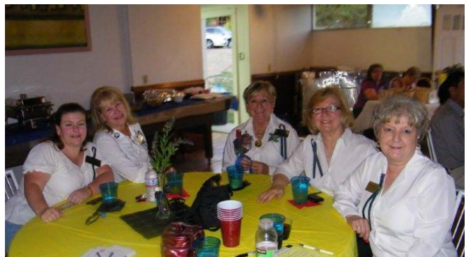
HARBOR MESA LIONS