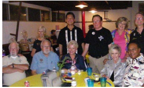
CABINET MEMBERS WITH CUCAMONGA DIST. HOST LIONS