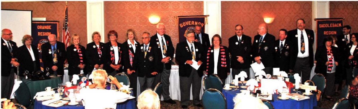
The newly installed cabinet members pose after their installation.