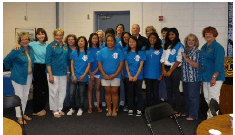
WELCOME IRVINE UNIVERSITY HIGH SCHOOL LEO'S CLUB SPONSORED BY THE HARBOR MESA LIONS CLUB JUNE 15, 2012