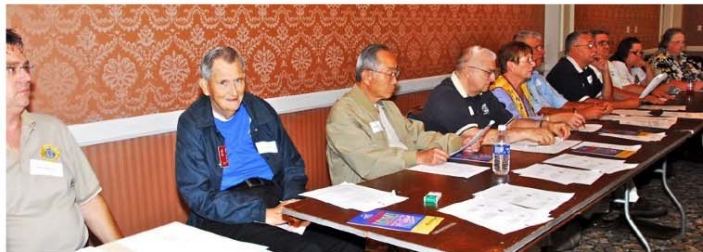
Lions participate in the "How to Run an Effective Meeting" workshop.