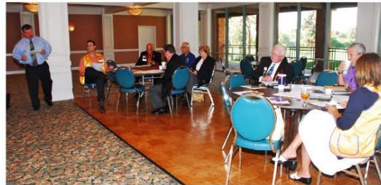
Lions learn how to run an effective meeting during the Leadership Academy.