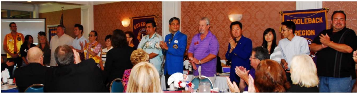
First Timers are introduced.