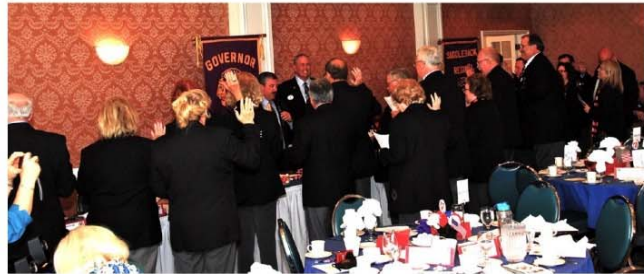
Cabinet members take the oath of office.