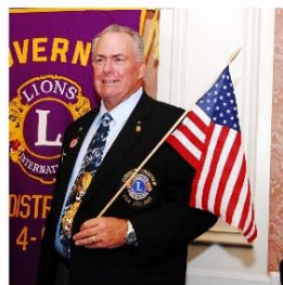
DG PJ displays the flag during "You're a Grand Old Flag."