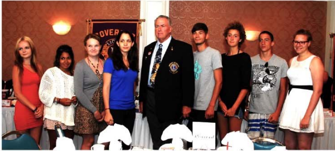
Lions Youth Exchange students are introduced to the Lions attending the cabinet meeting.