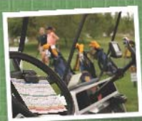
TUSTIN HOST LIONS ANNUAL GOLF CLASSIC WEDNESDAY, APRIL 25