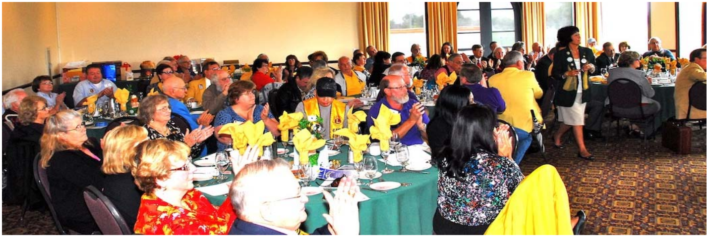
IT WAS A FULL HOUSE AT MEADOWLARK GOLF COURSE, HUNTINGTON BEACH