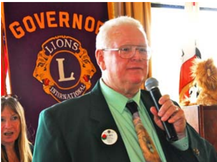
FOOTHILL REGION CHAIR GIVES PRESENTATION ON CEP