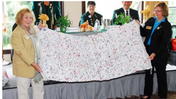
RECYCLED MAT FOR THE HOMELESS