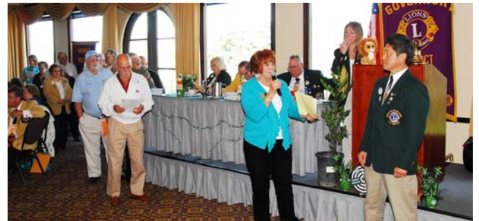
LOTS OF CLUB ANNOUNCEMENTS