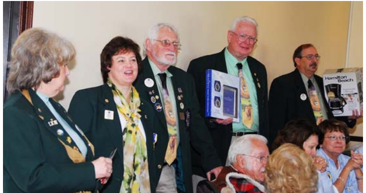
CABINET OFFICERS HELP WITH THE RAFFLE