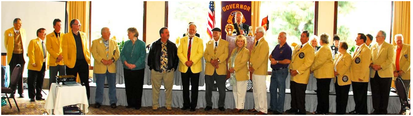
DISTRICT 4-L4 PAST DISTRICT GOVERNORS ARE HONORED