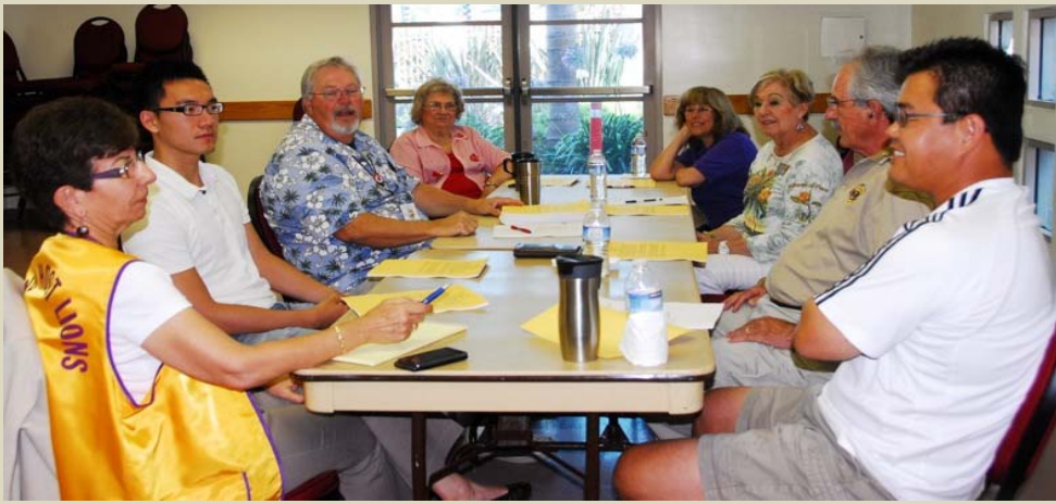
TAIL TWISTER'S TRAINING