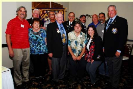
La Habra Host Lions Club