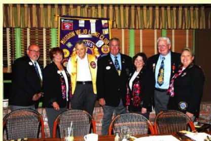
Mission Viejo Lions