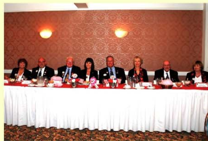
Harbor Mesa Head Table