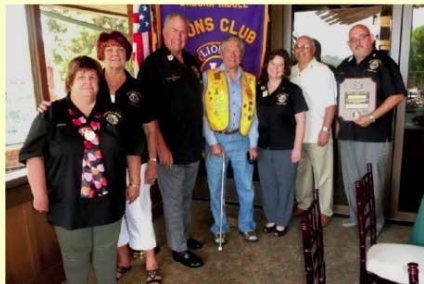
Laguna Niguel and San Clemente Lions