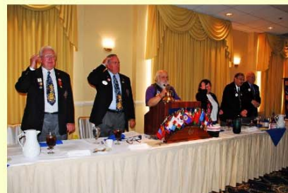
"I've got that Lions Spirit...."