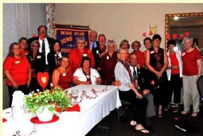
Ontario Upland Lions