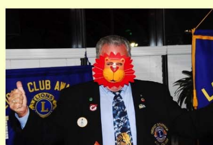
DG PJ wears lion mask.