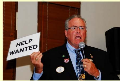
DG PJ speaks to club.