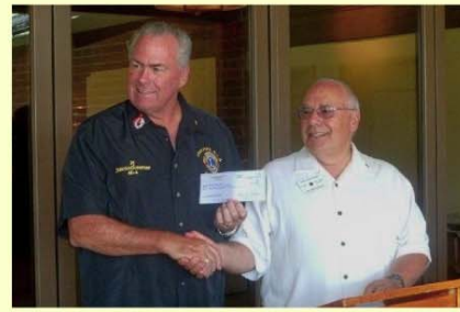
Laguna Niguel presentation