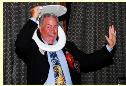
DG PJ wears the RCC Lions toilet seat painted with PJ's logo..