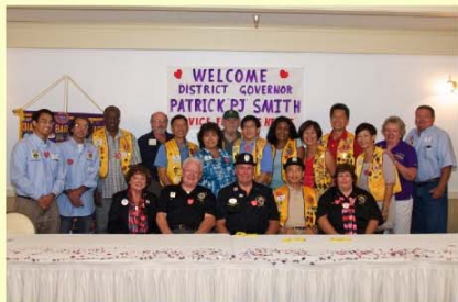
Diamond Bar Breakfast Lions Club