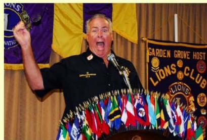
Animated DG PJ