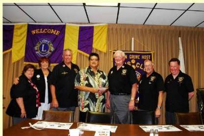
Garden Grove Host Lions Club