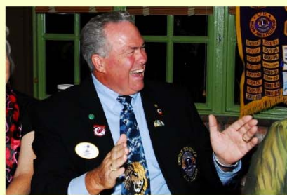
DG PJ jokes with the members.