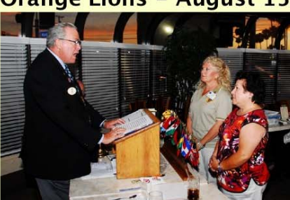
DG PJ conducts induction.