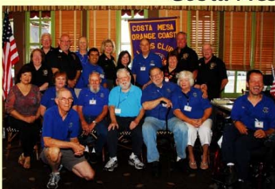
Costa Mesa Orange Coast Breakfast Lions