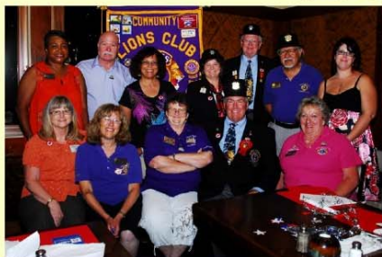
Rancho Cucamonga Community Lions