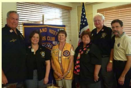
Upland Host Lions