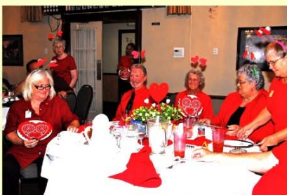
Hearts for PJ