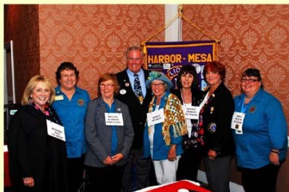
Harbor Mesa Lions Club