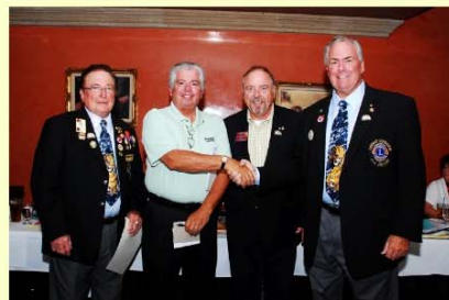
CDH Lions welcome new member.