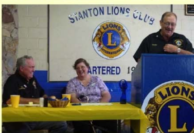
Stanton Host Lions Club