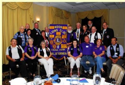
Buena Park Noon Lions Club