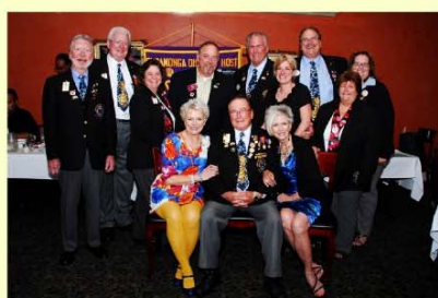
Cucamonga District Host Lions Club