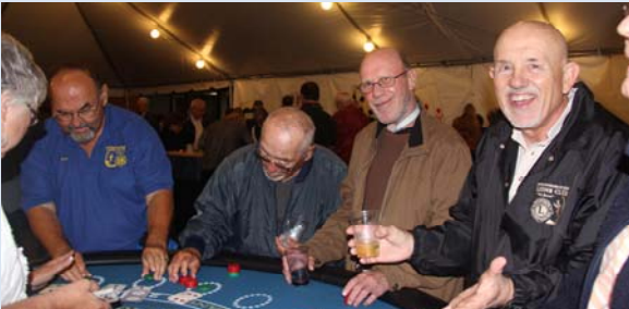
HUNTINGTON BEACH HOST LIONS