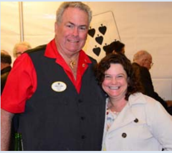
Gov. PJ & 1 ST VDG SHIELA