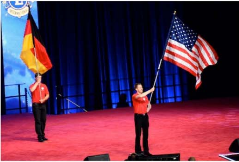
The U.S flag is waved during the Flag Ceremony. Our flag was next to last because Lions began in our country. The host country Germany was last.