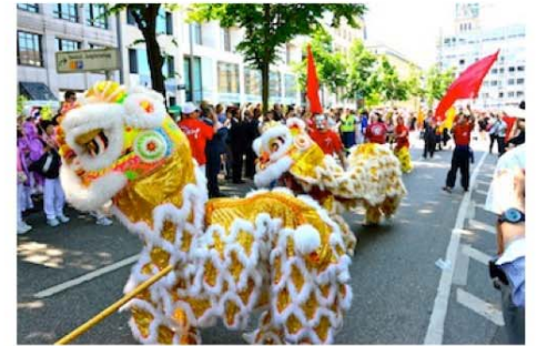
Every parade needs dragons!