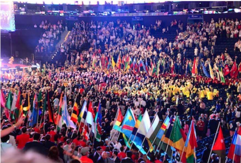
After each country cheered for its own flag as it was presented, all countries joined together to sway in unison and sing "I'd Like to Teach the World to Sing in Perfect Harmony" -- a poignant moment for everyone.