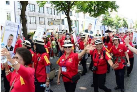
California Lions wear red in the parade.