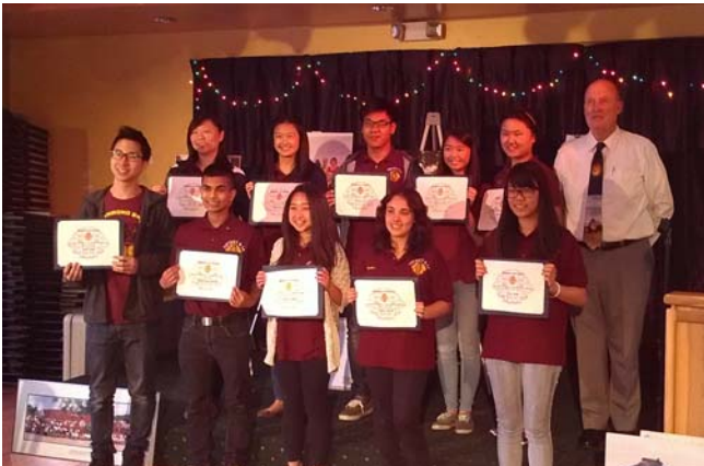
DISTRICT LEO OFFICERS RECEIVE RECOGNITION AWARDS