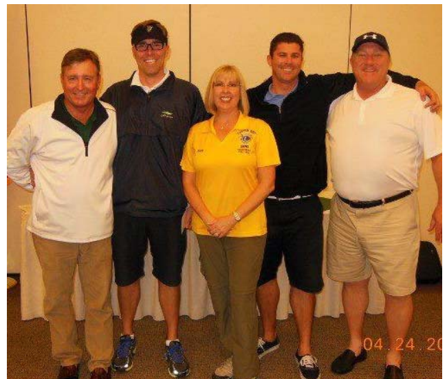
THE TUSTIN HOST LIONS CLUB CELEBRATES THEIR SUCCESSFUL 24TH ANNUAL CHARITY GOLF CLASSIC