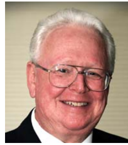
2nd Vice District Governor