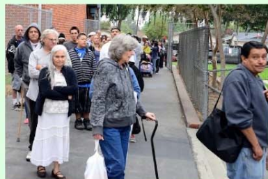
People line up for California Lions Friends in Sight early in the morning.

The California Lions Friends in Sight vision event was part of a WesternU Lions Health Fair. Four other medical areas were represented with screenings or information dissemination.