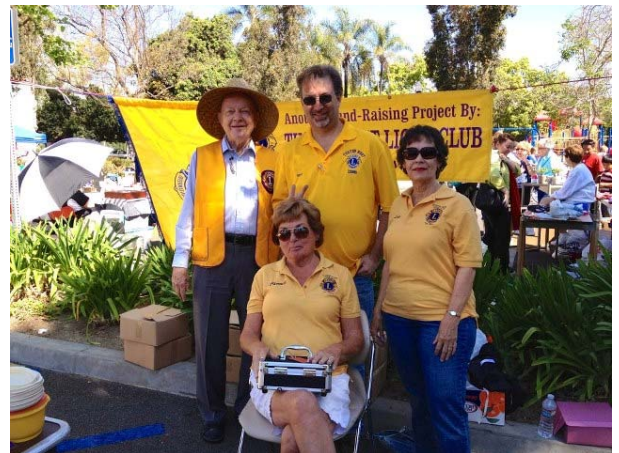
TUSTIN LIONS ENJOYED A BEAUTIFUL DAY WORKING A FUNDRAISER AT THE CITY OF TUSTIN'S COMMUNITY YARD SALE ON SATURDAY APRIL 23