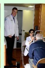
Inside the Lions Vision and Hearing Van