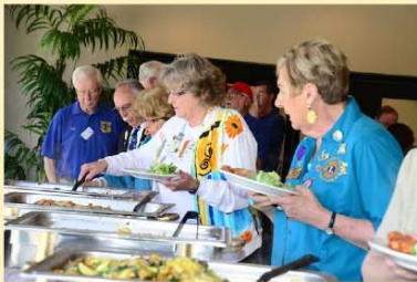
Lions go through buffet line at the cabinet meeting.