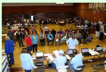
People wait in the Marshall School gym for Friends in Sight vision screening and glasses.