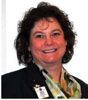
1 st Vice District Governor