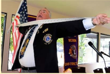
DG PJ sells raffle tickets by the arm's length.