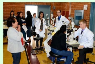
College of Optometry students run tests on patients at the Friends in Sight event.