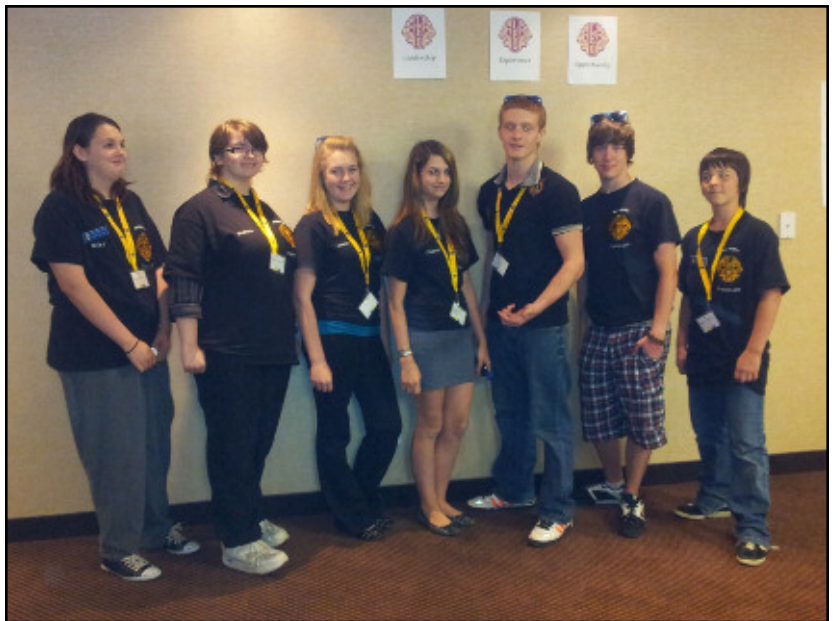
Stamford Leos at the Grape and Wine parade in St. Catharines.