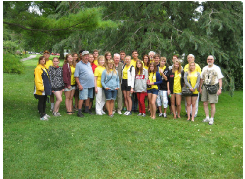
Youth Exchange members with Camp Counsellors in Chippawa.