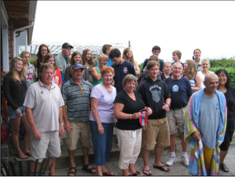
Governor Allen with Youth Exchange young people visiting Niagara Falls.