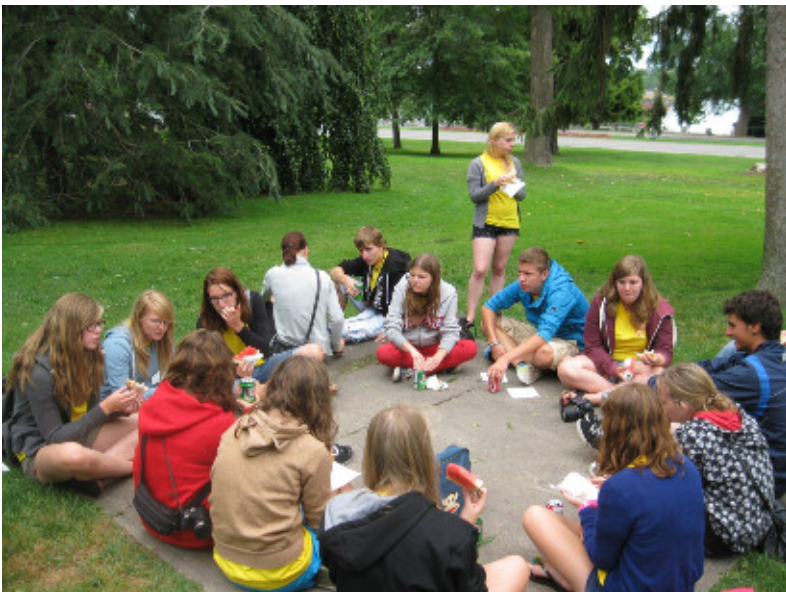
Youth Exchange group lunching along the Niagara Parkway with their Chippawa Lions Hosts.