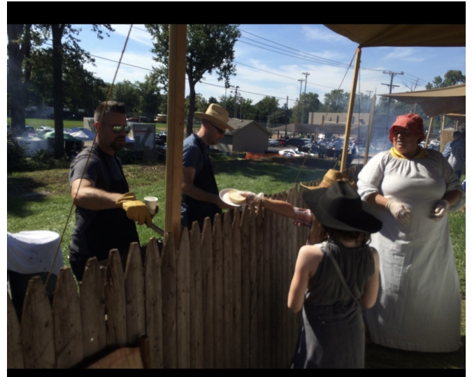
Anthony Wayne Lions Club at the Johnny Apple Festival.