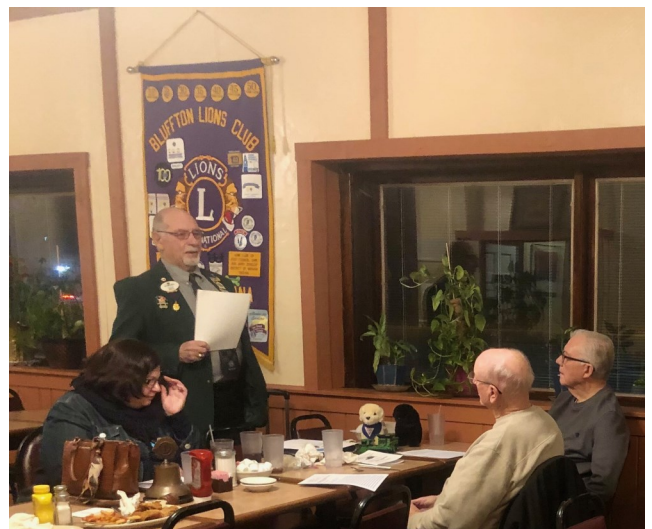
Interesting evening at my Official Visit with the Bluffton Lions Club.