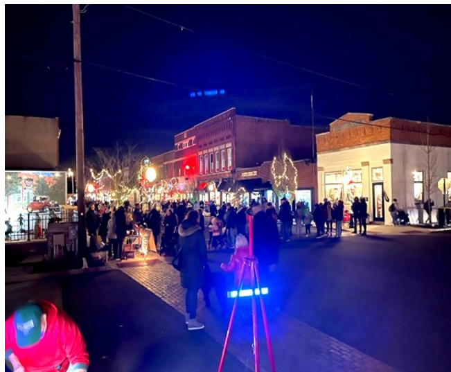
Crowd anticipates Santa's arrival

On December 2 nd , Roanoke Lions participated in the Parade of light event in downtown Roanoke serving those in attendance nearly 300 free hot dogs, chips and bottled water. It was a great day to be a Lion as families enjoyed the parade and had an opportunity to share their Christmas with Santa who arrived by fire truck. While there wasn't a charge for anything, families that felt the need to donate were able to place donations in the bucket for the Salvation Army. Nearly $300.00 was raised and a good time was had by all.