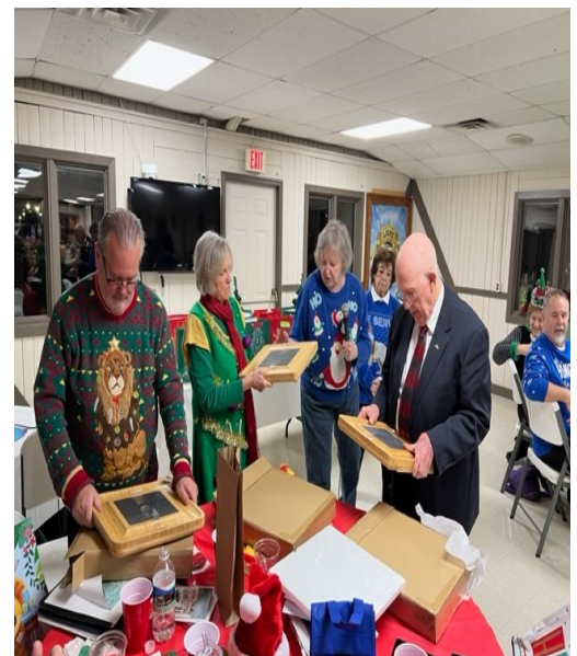
Opening their boxes, they found wood with removable slate Charcuterie boards. Each also received a $50 VISA Gift Card.