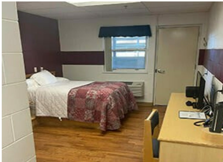
My humble abode. The door heads out to the courtyard.

If anyone is interested and wants to see my daily activities or training I am going to try and update every evening and post any pics I am able to take. Each pic will have a description. So, after breakfast we had a meeting to introduce ourselves and the trainers. We are the very first class to welcome some students from the UK. We have four students plus an instructor being taught by Leader Dog. They have a massive waitlist in England for people who need a guide dog. America stepped up to help. After the meeting we were taught how to harness the dog and use the special made leash. Then we had our first “Juno” walk, which is a human holding the harness while I give her the directions. Kind of “practice” before handling my actual dog. Then we broke for lunch and had some free time. After lunch we loaded up in buses, or what our British friends called carriages. Lol. We headed downtown for another “Juno” walk, this time a couple city blocks around the other [Leader Dog] facility. Once back we had a fire drill and GPS training, as they give you GPS units that help with traveling by yourself. It’s a $900 device that they provide for free. Pretty cool stuff. Then we had dinner and the rest of the evening off.