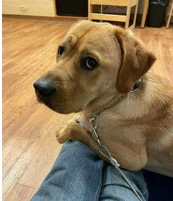
Tucker says, “Can I play now?”

Well, just like in all areas of life and learning, there are ups and downs. Today started on a down. And honestly I blame myself more than Tucker. Park time isn’t until 6:30 a.m. I wanted to go get a cup of coffee at about 5:50 and didn’t want to leave him behind. So off we went, and... he decided to “park” in the front office. It’s happened with other dogs I’m sure, just hate that it happened. So going forward, as soon as we both wake up, we don’t have to wait until scheduled park time anymore.