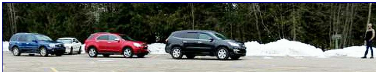
Hillman Lions distributed food to community members at a Pop-Up Pantry on Saturday, January 9.