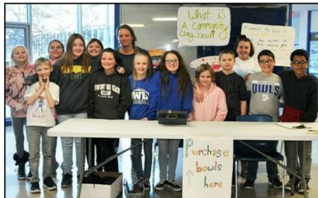
Group picture of the kids that made the bowls

The Oscoda Lions club held its ninth Annual Souper Bowl Supper on Friday night, February 7, 2020. The event featured 29 different soups prepared by 25 Lions and four community volunteers. Richardson Elementary Schools art class students made ceramic bowls to sell at the supper. The money raised from selling the bowls will go towards helping fight Hunger, and the money raised by the soup dinner goes to helping our charities.