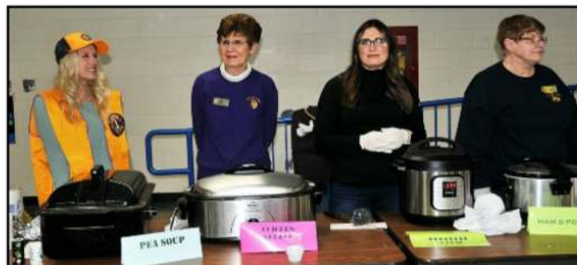
—Lions serving soups

We would like to thank everyone who came out to attend the supper (250) and five businesses that helped us, Family Fare, Vinnie's Hardware, KFC, Rogers, and Vista Lanes.