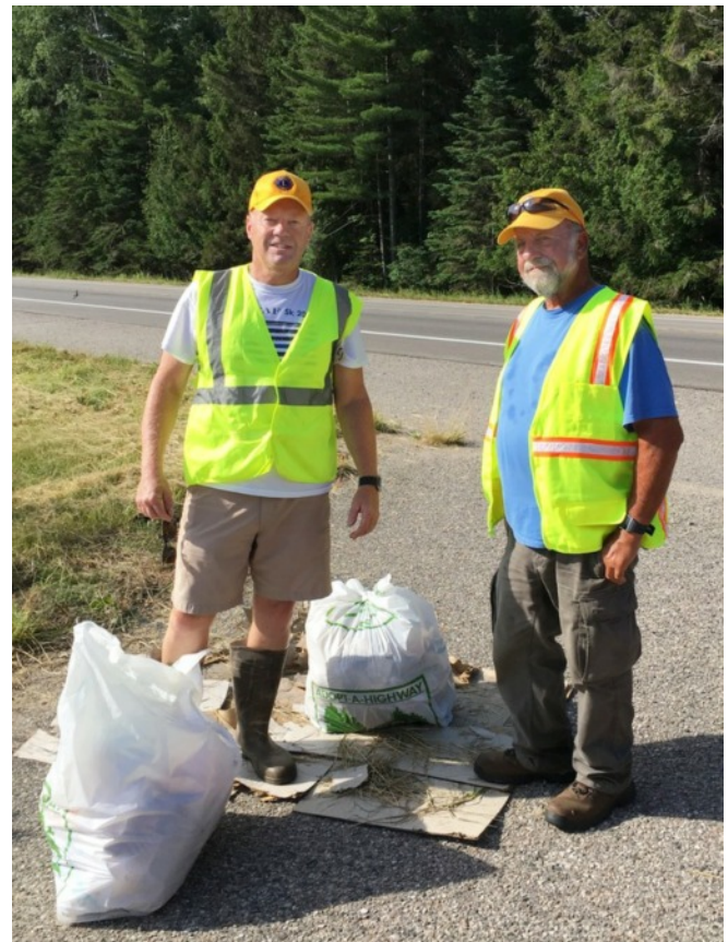
Lions Tamlyn & Beethem help keep the community clean with Highway cleanup week. Cheboygan Lion's cover 2 miles US-23 W from the city limits of Cheboygan.