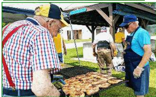
July 4th float and traditional chicken BBQ dinner. Lions and community volunteers served 350 chicken dinners in 1 hour!