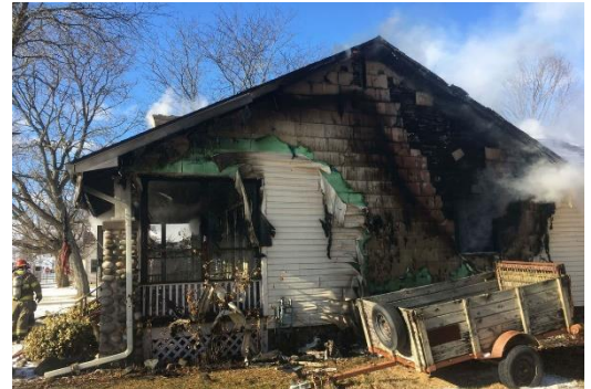
Oscoda Press, January 23, 2018 article by Jenny Haglund.