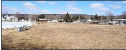
Left: The Open space before work began; Below: Lions toil in the soil to landscape the site

The Boyne Valley Lions Club celebrated its 50 th anniversary in 2017 while the larger Lions Clubs International Organization celebrated its centennial anniversary in the same year. The motto for the Lions is "We Serve" and the Boyne Valley Lions Club has chosen to serve their community by dedicating a beautiful seating group in the Open Space property across from Family Fare. The plans for the seating group were drawn up last year and