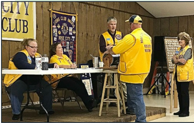
Below: Callers at the Big Money Raffle