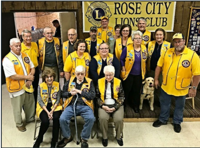
Above: Rose City Lions at the Big Money Raffle

The Rose City Lions Club had a successful Big Money Raffle on September 29, 2018. All of the 175 tickets were sold, 183 people enjoyed the dinner that Lions supplied. Many people went home with money in their pockets from the raffles. There were 3 people who chose to split the Grand prize with each taking home $1,000.00 at the end of the night. Very successful fundraiser for the public fund and our community!