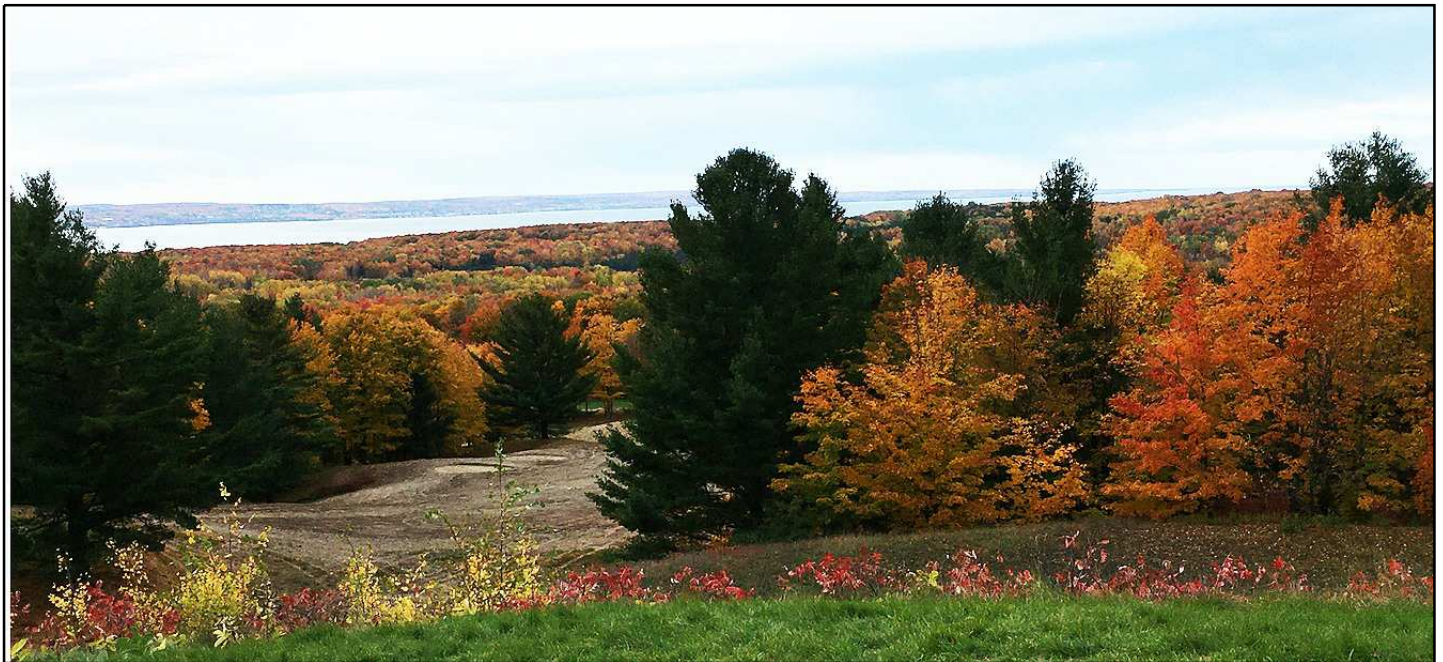
Autumn's splendor spread out on the hills overlooking Little Traverse Bay