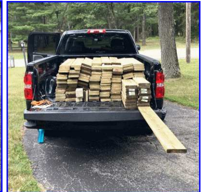
Lumber for the project brought in by two vehicles