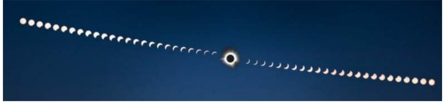
Total solar eclipse