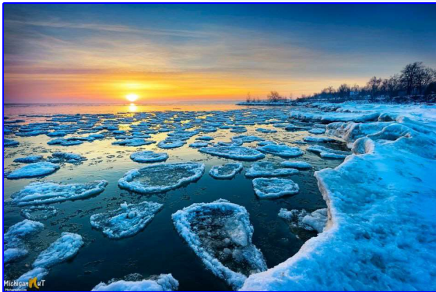
Sunset and Ice

Stock Winter photos taken at various places Throughout Michigan