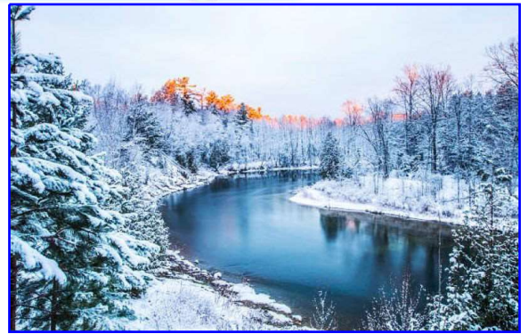
Winter River Between Snowy Shores

Stock Winter photos taken at various places Throughout Michigan