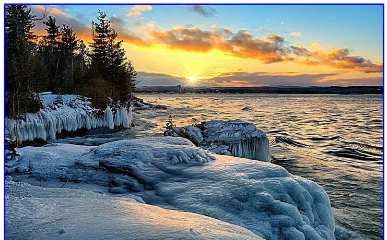
Great Lake Sunset