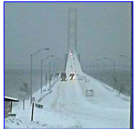
Mackinac Bridge On Snowy Day