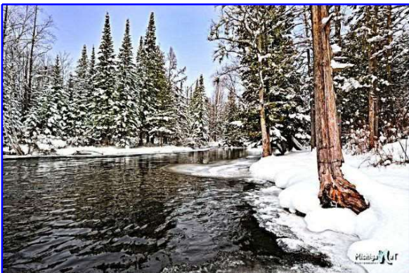
Jordan River Near East Jordan

Intriguing Cloud Formations on Winter Day