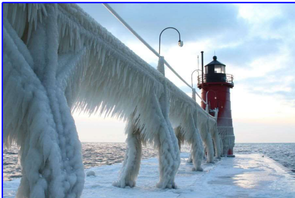
Lighthouse In Ice