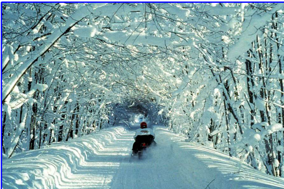
Snowmobiling Tunnel of Snowy Trees