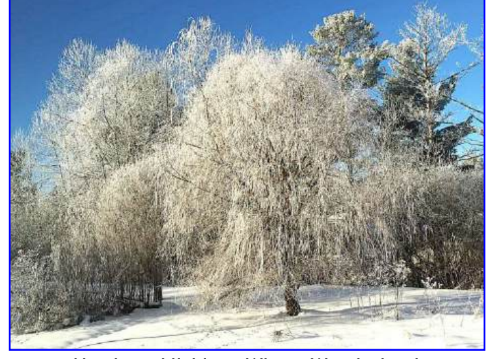
Northern Michigan Winter Wonderland