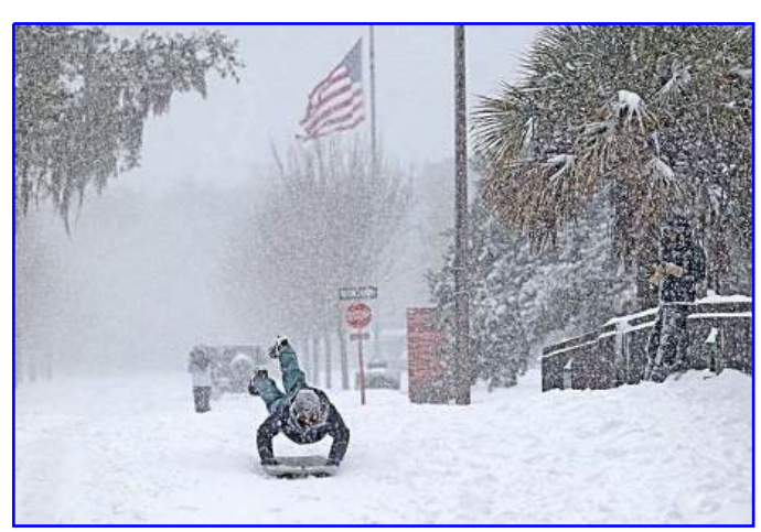
New Orleans sledder in storm 2025