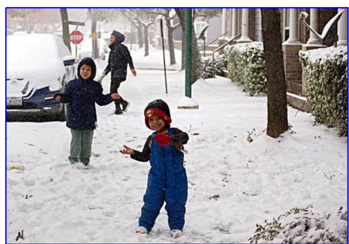
Houston Children in snow.