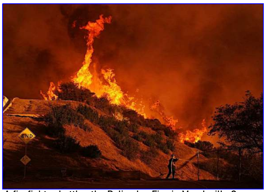
A firefighter battles the Palisades Fire in Mandeville Canvon