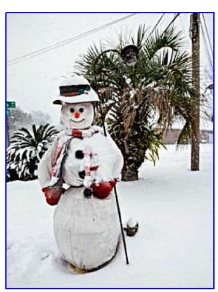
Pensacola FL. Snowman