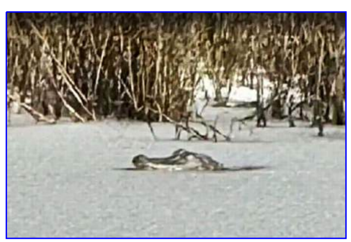
Alligator immobilized in a frozen Southern lake