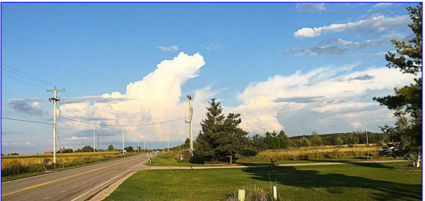
Picturesque late summer clouds in Northern Michigan skies.