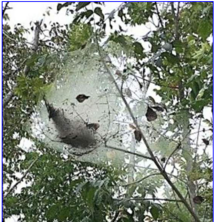
Fall Webworm Caterpillars nests are constructs of loose, expanding webs at the ends of branches, enclosing leaves and twigs. Nests become visible in late summer and early fall. The caterpillars feed and live within the web, which gets larger as they grow.