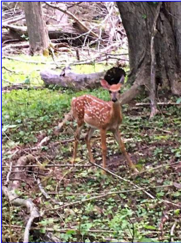
A growing fawn in the Bear River park, one of 2 fawns who, with their mother, are seen frequently near the river.