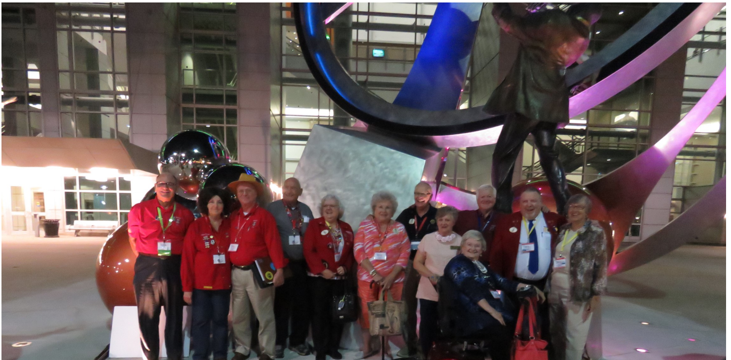
Most of the Arkansas Lions at the USA/Canada Lions Leadership Forum