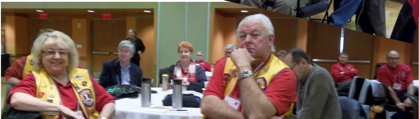
Learning and enjoying other Lions!