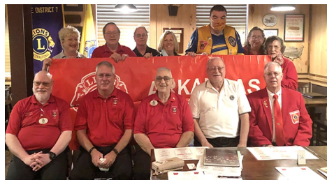
The Council of Governors and other Lions from around the state at the Council's first meeting.