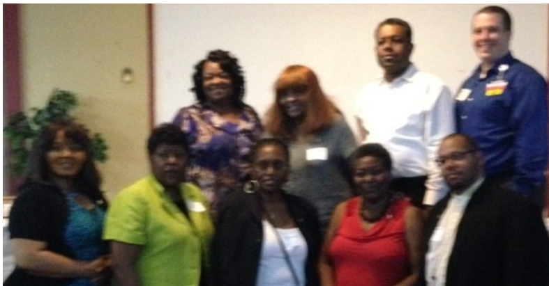
Marianna Lions Club members