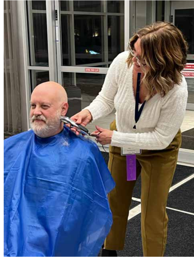
HAIR CUT AND SHAVE FOR A GOOD CAUSE