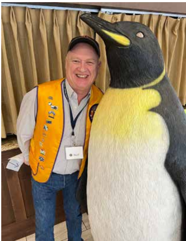
Posing with the penguin