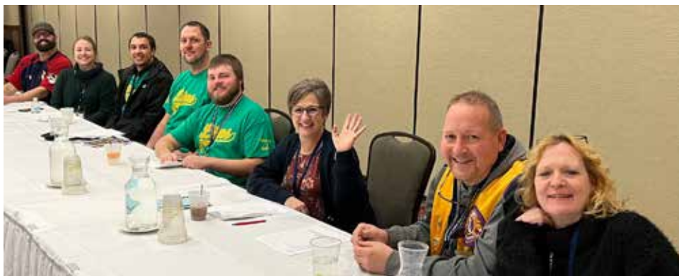
A great group of 'First Timers'