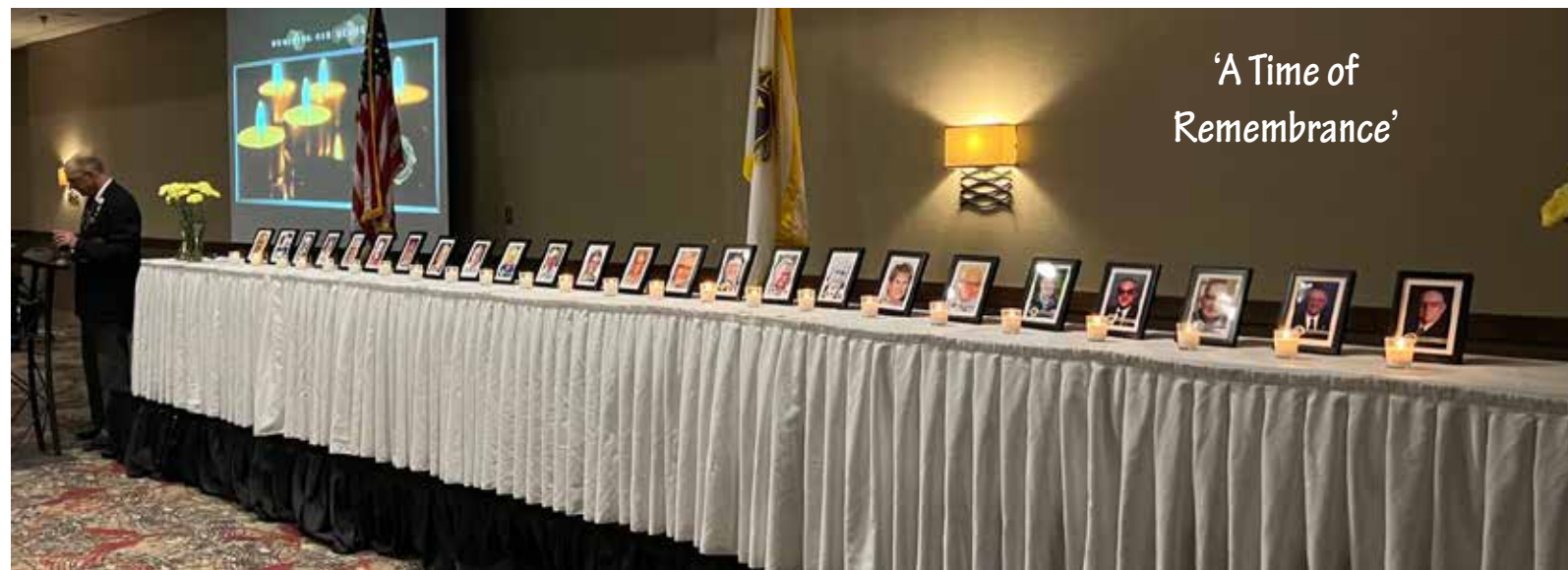
'A Time of Remembrance'

Need something in the newsletter? Send to: gcanne@runestone.net