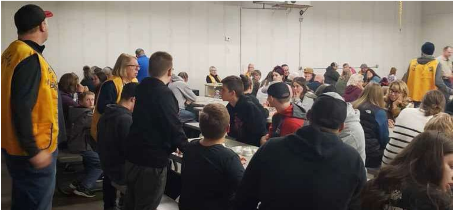
Elbow Lake Lions hold 'biggest ever' Turkey Bingo event!